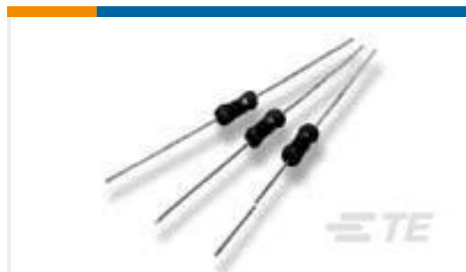
TE Part #1625892-5 3W SM M/OX 5% R47