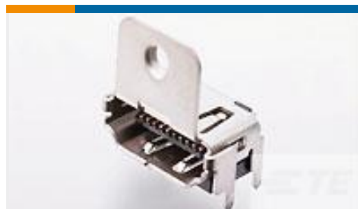
TE Part #1-1747981-4 Std HDMI, RA, SMT, Panel grd, Flange