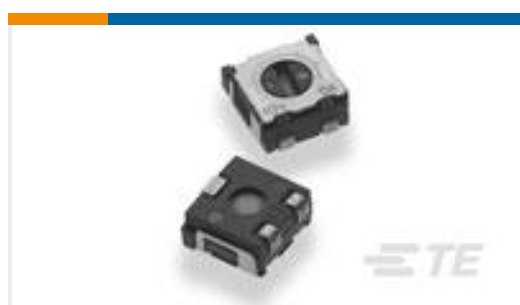
TE Part #1879029-2 3213 1K