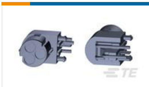
TE Part #293593-1 NECTOR M PIN 0DEG PCB 3P CODE A