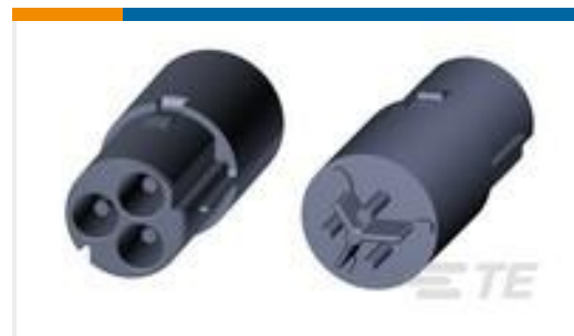
TE Part #293590-1 NECTOR M PIN 90DEG PCB 3P CODE A