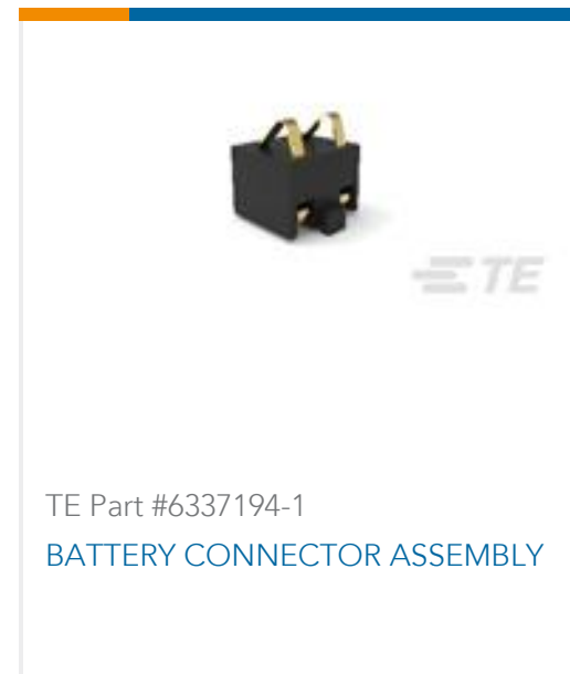
TE Part #6337194-1 BATTERY CONNECTOR ASSEMBLY P=3.2, PKG