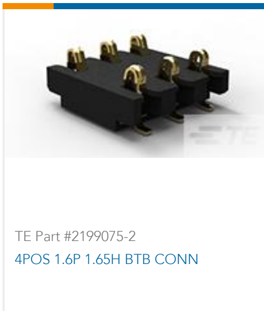
TE Part #2199075-2 4POS 1.6P 1.65H BTB CONN