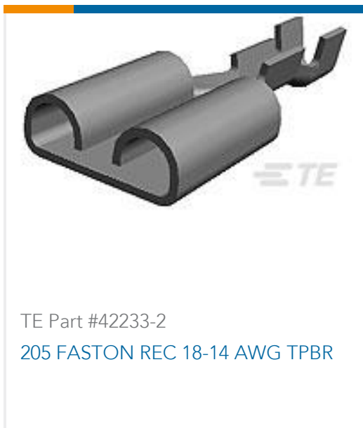
TE Part #42233-2 205 FASTON REC 18-14 AWG TPBR