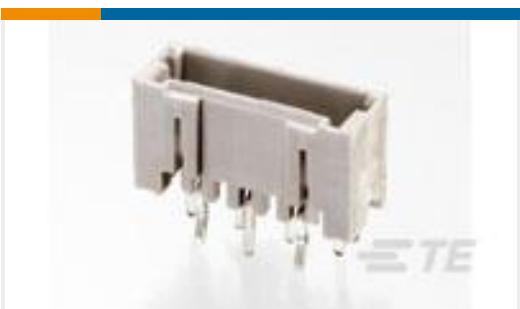
TE Part #1-292207-3 MINI CT SGL DIP V 13P NAT