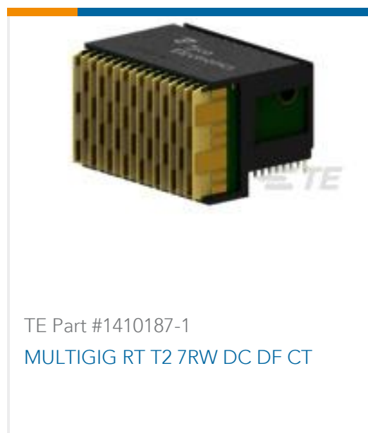
TE Part #1410187-1 MULTIGIG RT T2 7RW DC DF CT