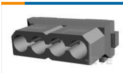
TE Part #794287-1 04P CMNL HDR ASSY BLK HT