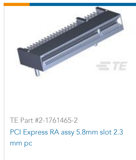
TE Part #2-1761465-2 PCI Express RA assy 5.8mm slot 2.3 mm pc