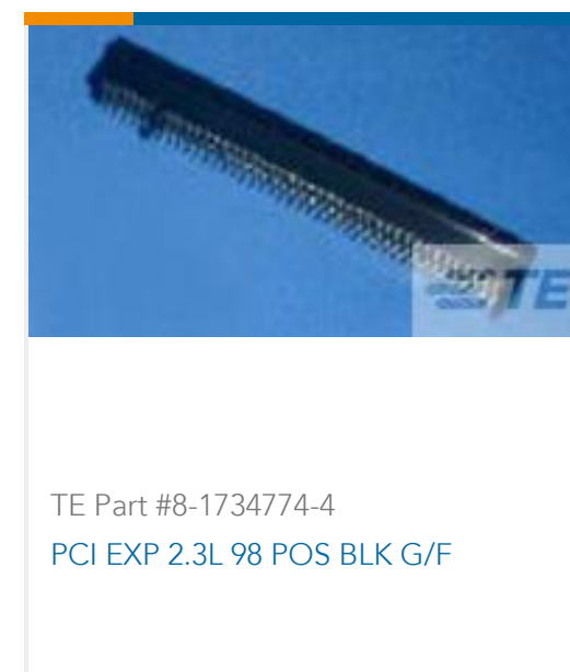
TE Part #8-1734774-4 PCI EXP 2.3L 98 POS BLK G/F