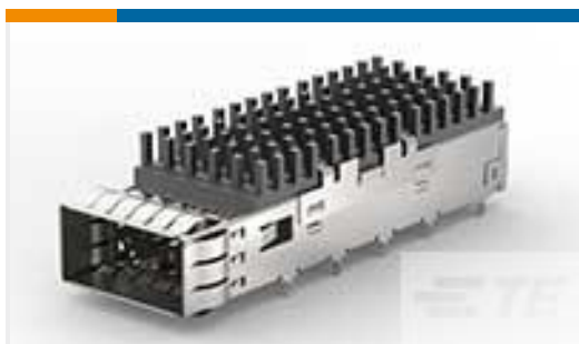
TE Part #2170704-2 CAGE ASSY, QSFP28 1X1, SPRING, HS