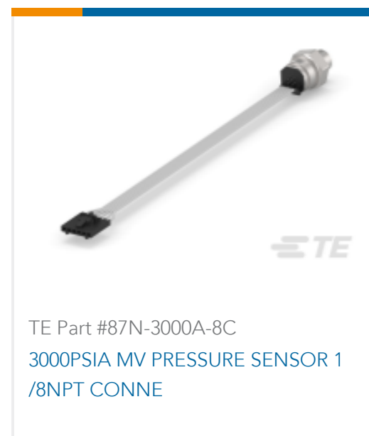
TE Part #87N-3000A-8C 3000PSIA MV PRESSURE SENSOR 1 /8NPT CONNE