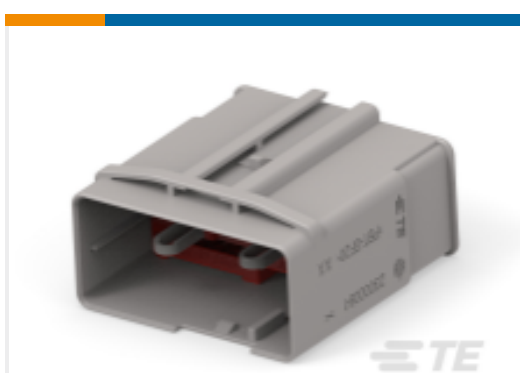
TE Part #2300007-1 24POS,0.64 MALE GEN. Y,PIN HSG, ASSY