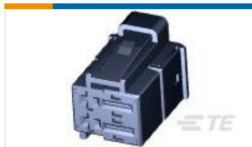
TE Part #1-1418507-2 SOCKET HSG 4POS.,AMP MCP2.8 /MCP6.3K