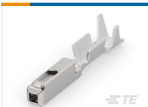
TE Part #5-968221-1 MQS0,63 Sn rec CB unseal. 0,5-0,75