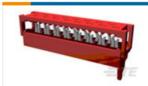
TE Part #8-215083-8 MICRO-MATCH MOW.18P