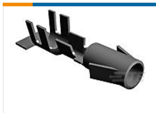
TE Part #926986-1 MNL BUCHSE 3,5 MM