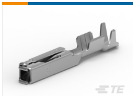
TE Part #1719958-1 GET 0.64 TERMINAL WIRE SIZE 0.