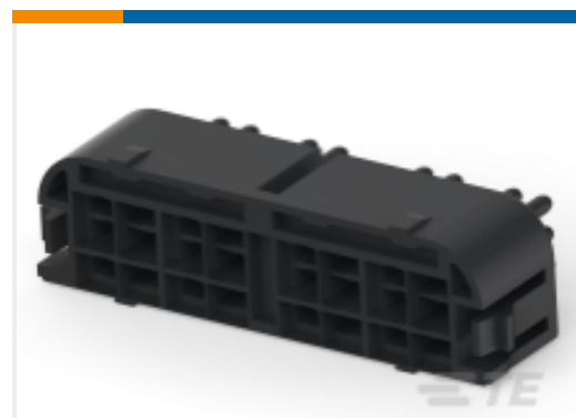
TE Part #2208855-9 COVER FAM. SEAL NANO MQS, 24POS