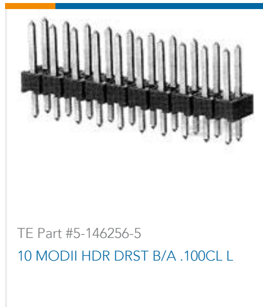
TE Part #5-146256-5 10 MODII HDR DRST B/A .100CL L