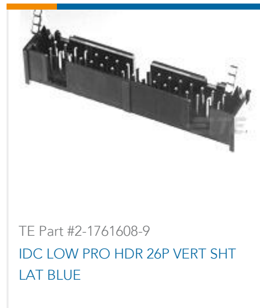
TE Part #2-1761608-9 IDC LOW PRO HDR 26P VERT SHT LAT BLUE