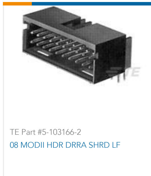
TE Part #5-103166-2 08 MODII HDR DRRR SHRD LF