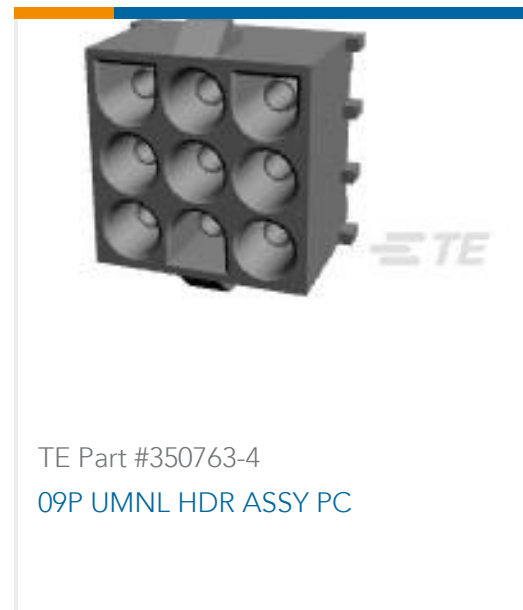
TE Part #350763-4 09P UMNH HDR ASSY PC