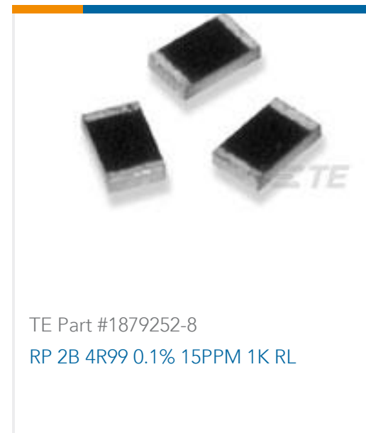
TE Part #1879252-8 RP 2B 4R99 0.1% 15PPM 1K RL