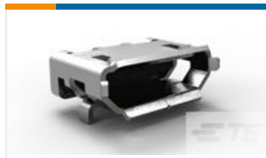
TE Part #2013499-1 MICRO USB, TYPE B