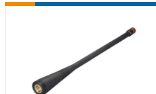
TE Part #ANT-433-CW-QW-SMA Antenna 1/4 Wave Whip 433MHz SMA