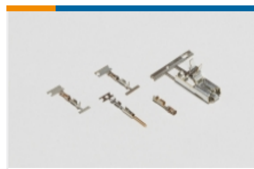
Wire-to-Board Connector Contacts(27)