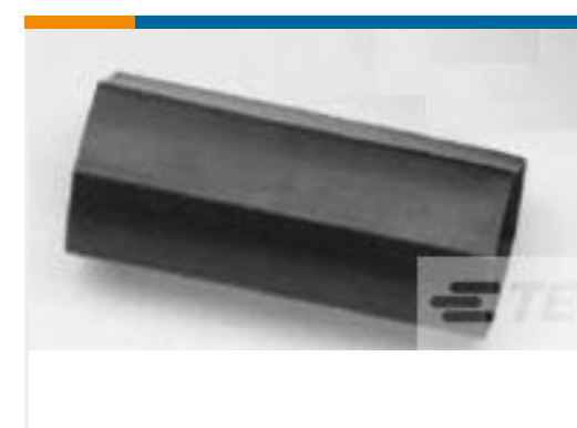
TE Part #134710-000 HRHT-2/3