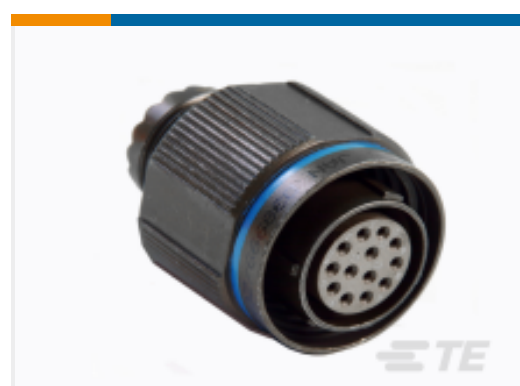
TE Part #YDTS26W13-04SNV001 PLUG ASSY