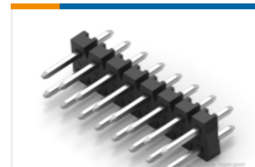
TE Part #1-2842138-0 20P,2MM,BRK HDR,DRV,2.8,0.1AU, BOX