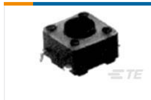
TE Part #1571563-4 FSM4JSMAATR=TACTSWITCH,SMT, T&R