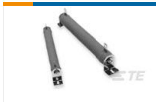
TE Part #1879450-7 TE 500W 3R3 5% Bracket