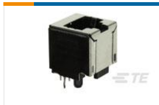
TE Part #6368150-1 MJ,TE,8P,CAT5,SHIELDED