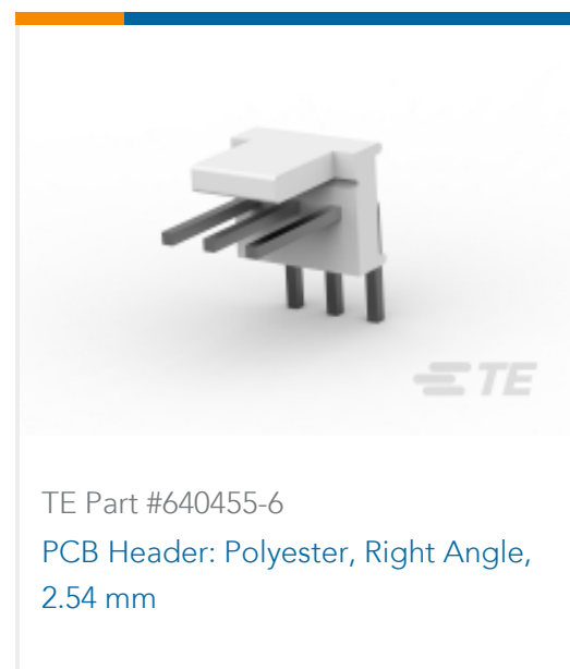
TE Part #640455-6 PCB Header: Polyester, Right Angle, 2.54 mm