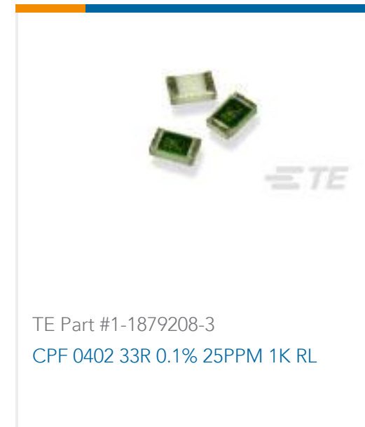
TE Part #1-1879208-3 CPF 0402 33R 0.1% 25PPM 1K RL