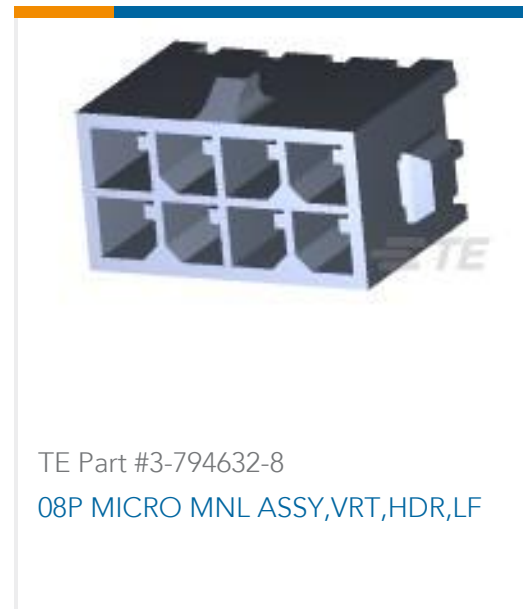
TE Part #3-794632-8 08P MICRO MNL ASSY,VRT,HDR,LF