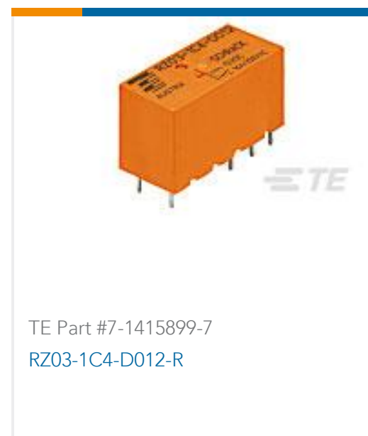
TE Part #7-1415899-7 RZ03-1C4-D012-R