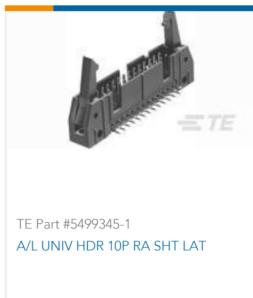
TE Part #5499345-1 A/L UNIV HDR 10P RA SHT LAT