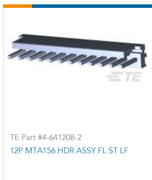
TE Part #4-641208-2 12P MTA156 HDR ASSY FL ST LF