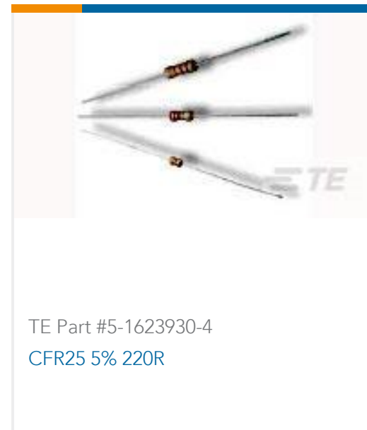
TE Part #5-1623930-4 CFR25 5% 220R