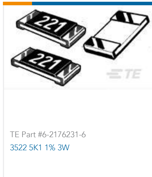
TE Part #6-2176231-6 3522 5K1 1% 3W