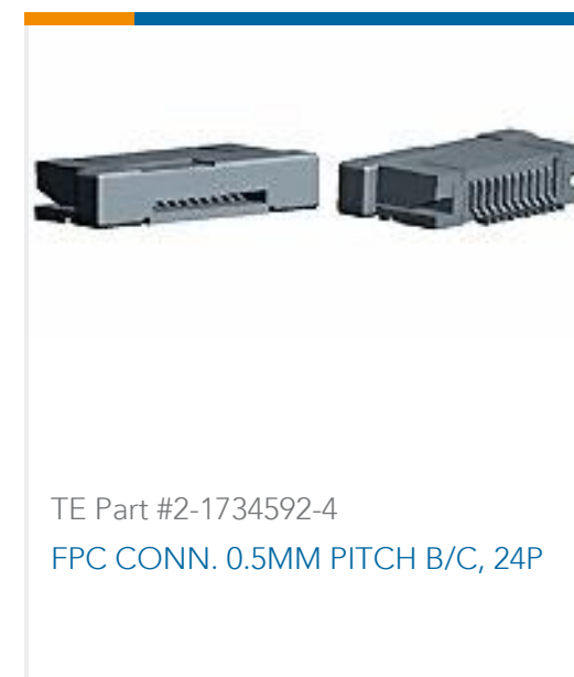
TE Part #2-1734592-4 FPC CONN. 0.5MM PITCH B/C, 24P