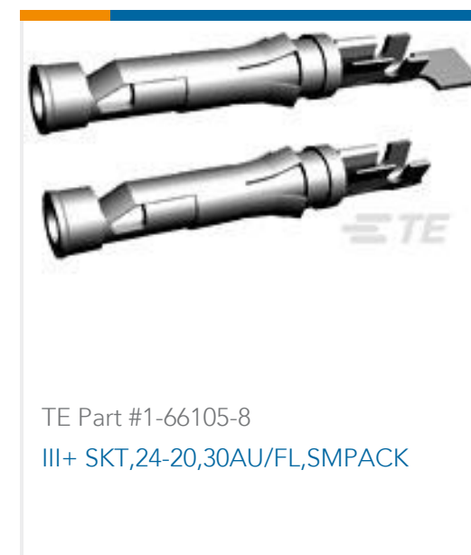
TE Part #1-66105-8 III+ SKT,24-20,30AU/FL,SMPACK