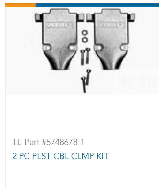
TE Part #5748678-1 2 PC PLST CBL CLMP KIT