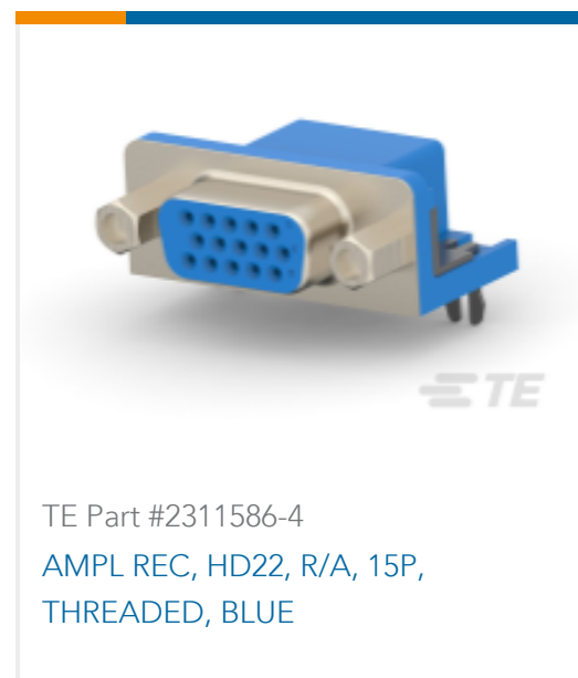
TE Part #2311586-4 AMPL REC, HD22, R/A, 15P, THREADED, BLUE