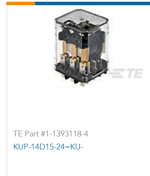
TE Part #1-1393118-4 KUP-14D15-24=KU-