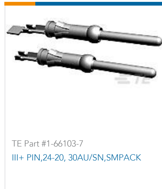
TE Part #1-66103-7 III+ PIN,24-20, 30AU/SN,SMPACK