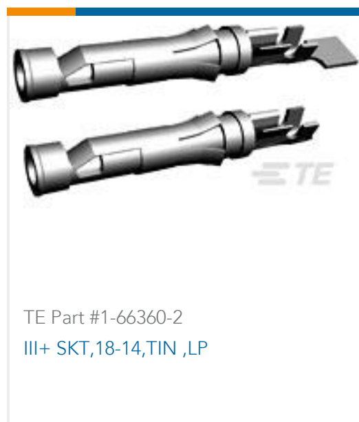
TE Part #1-66360-2 III+ SKT,18-14,TIN ,LP