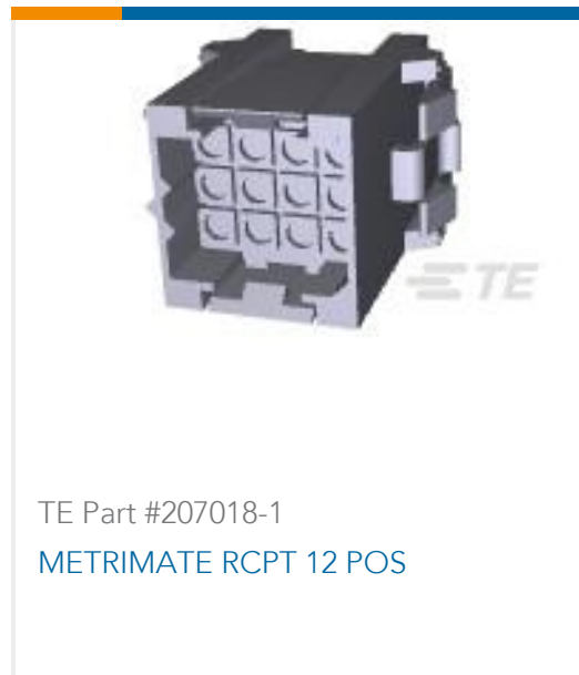
TE Part #207018-1 METRIMATE RCPT 12 POS