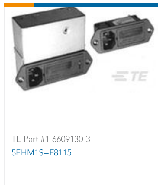
TE Part #1-6609130-3 5EHM1S=F8115