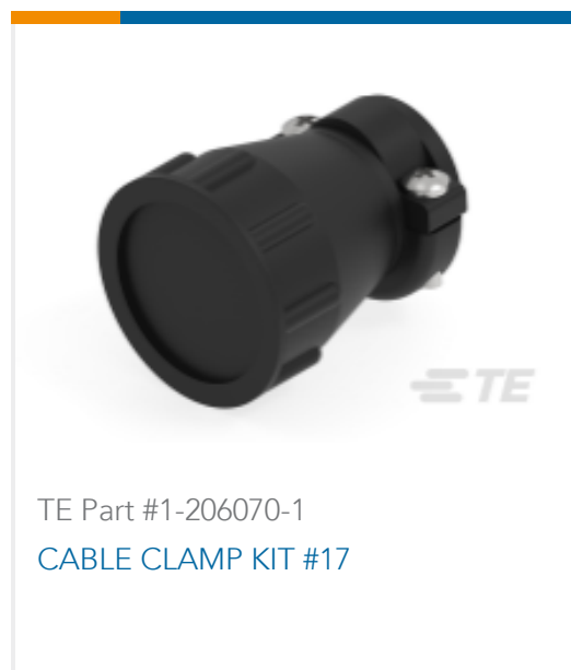
TE Part #1-206070-1 CABLE CLAMP KIT #17