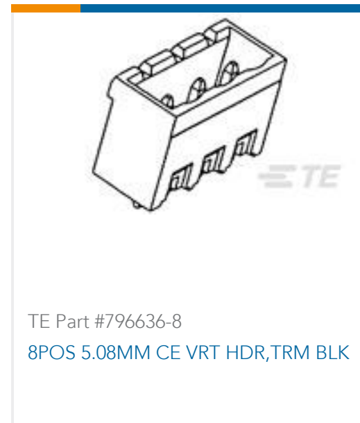
TE Part #796636-8 8POS 5.08MM CE VRT HDR,TRM BLK