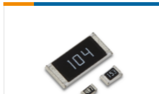
TE Part #3-2176339-3 CRGCQ 0603 4K7 1%