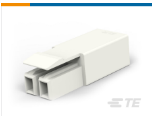
TE Part #2834048-1 PLUG, 2P LATCHED POKE-IN WTW CONN.NL