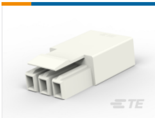
TE Part # 2834054-1 PLUG, 3P LATCHED POKE-IN WTW CONN.NL