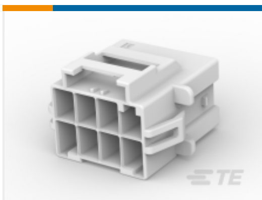
TE Part #1-1971772-2 Standard Temperature Caps | POWER TRIPLE LOCK