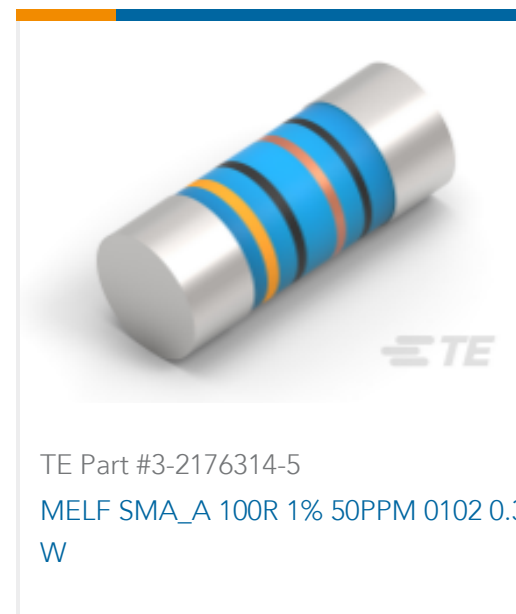
TE Part #3-2176314-5 MELF SMA_A 100R 1% 50PPM 0102 0.3 W