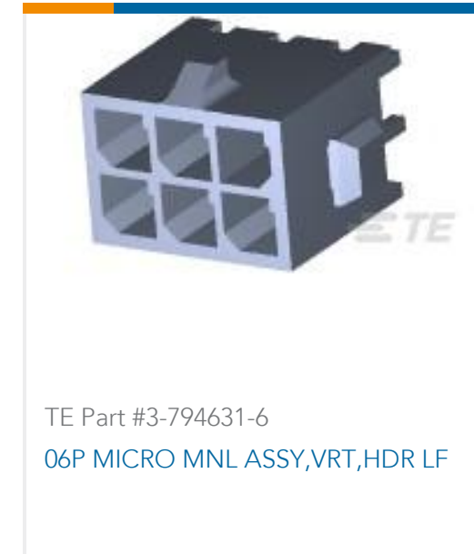
TE Part #3-794631-6 06P MICRO MNL ASSY,VRT,HDR LF