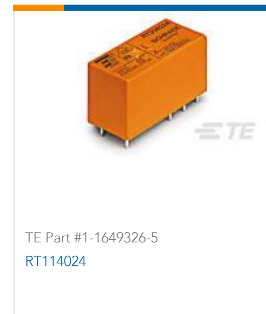
TE Part #1-1649326-5 RT114024