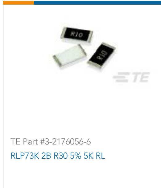
TE Part #3-2176056-6 RLP73K 2B R30 5% 5K RL