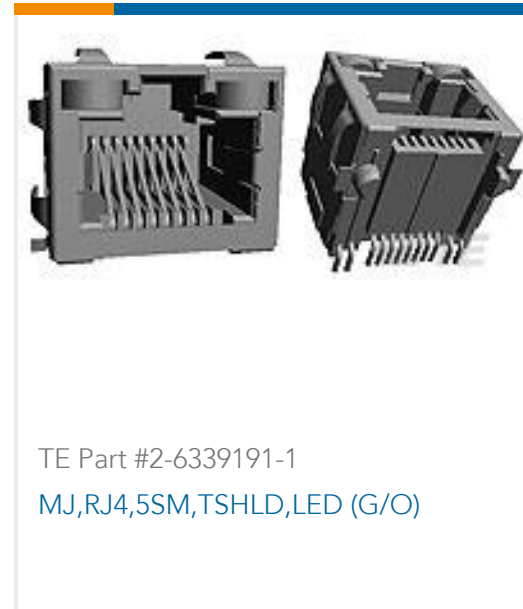
TE Part #2-6339191-1 MJ,RJ4,5SM,TSHLD,LED (G/O)