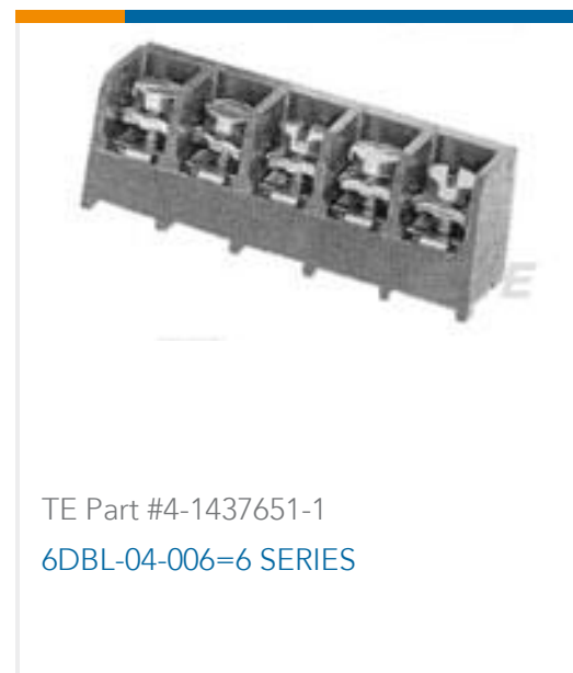
TE Part #4-1437651-1 6DBL-04-006=6 SERIES