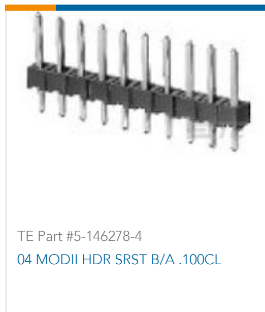
TE Part #5-146278-4 04 MODII HDR SRST B/A .100CL