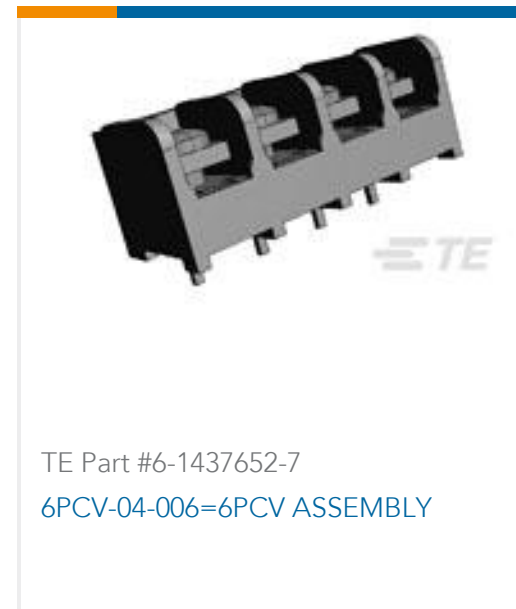
TE Part #6-1437652-7 6PCV-04-006=6PCV ASSEMBLY