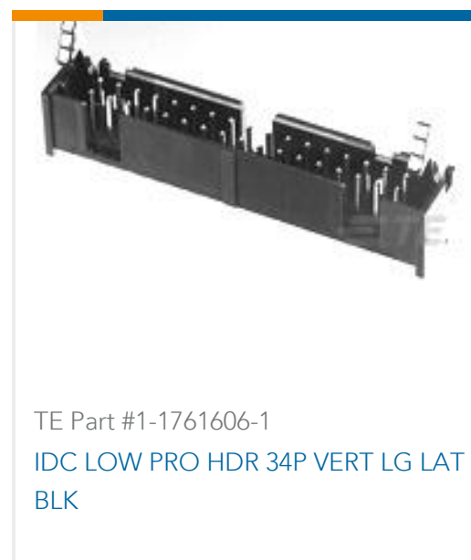
TE Part #1-1761606-1 IDC LOW PRO HDR 34P VERT LG LAT BLK