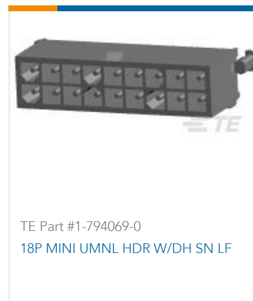
TE Part #1-794069-0 18P MINI UMNL HDR W/DH SN LF