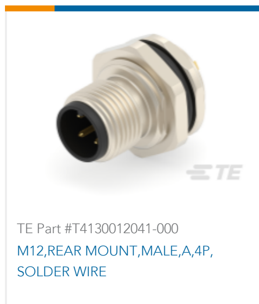
TE Part #T4130012041-000 M12, REAR MOUNT, MALE, A, 4P, SOLDER WIRE