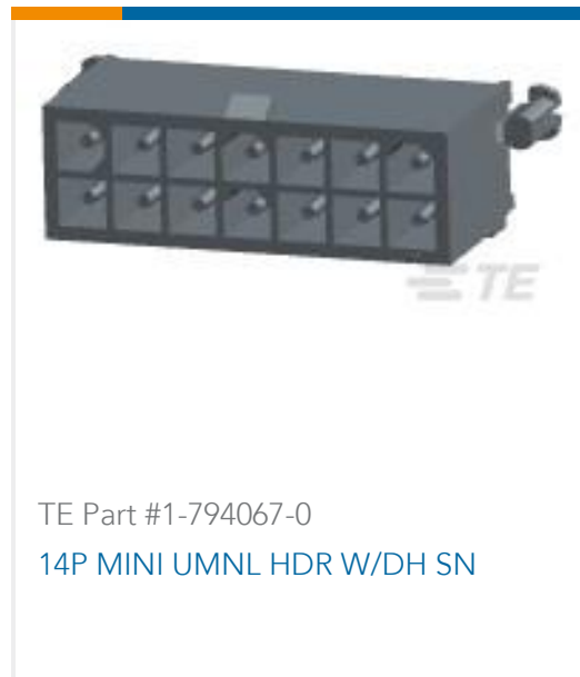
TE Part #1-794067-0 14P MINI UMNL HDR W/DH SN