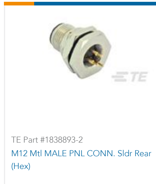
TE Part #1838893-2 M12 Mtl MALE PNL CONN. Sldr Rear (Hex)