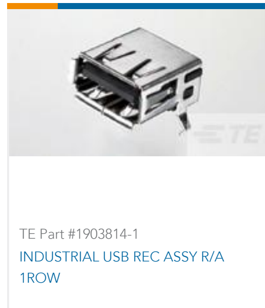
TE Part #1903814-1 INDUSTRIAL USB REC ASSY R/A 1ROW