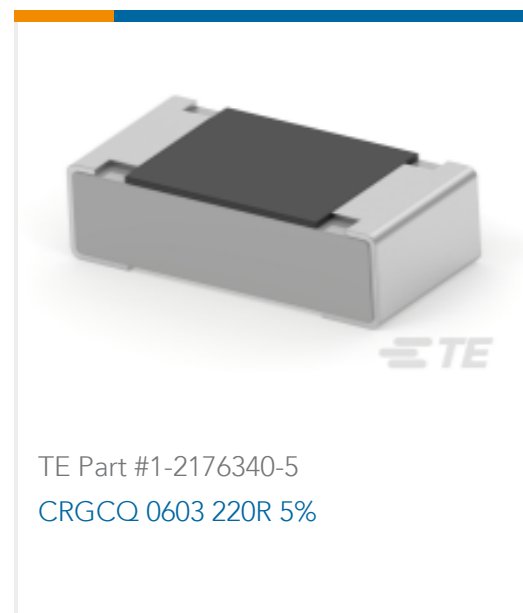
TE Part #1-2176340-5 CRGCQ 0603 220R 5%