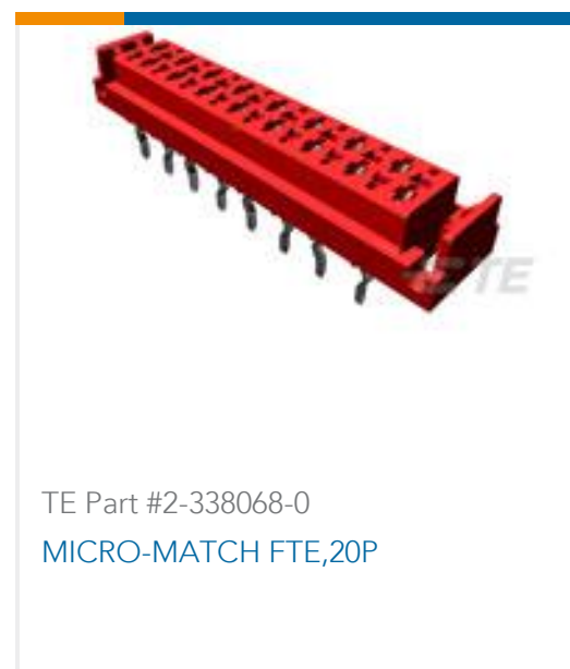
TE Part #2-338068-0 MICRO-MATCH FTE, 20P