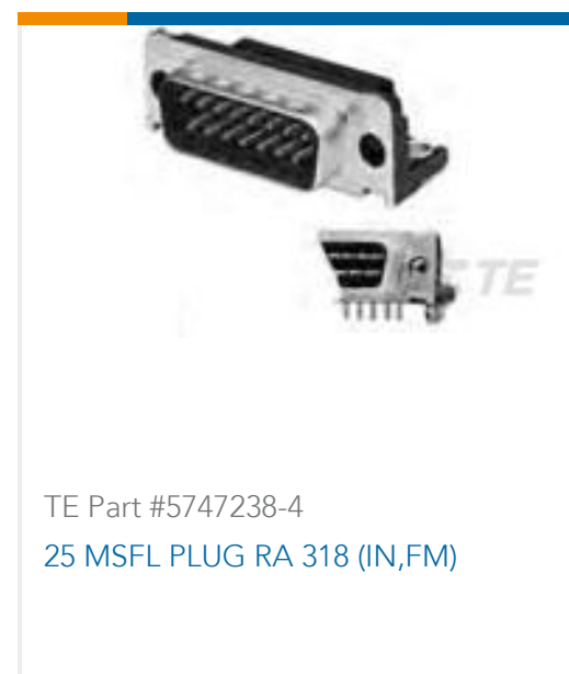
TE Part #5747238-4 25 MSFL PLUG RA 318 (IN,FM)