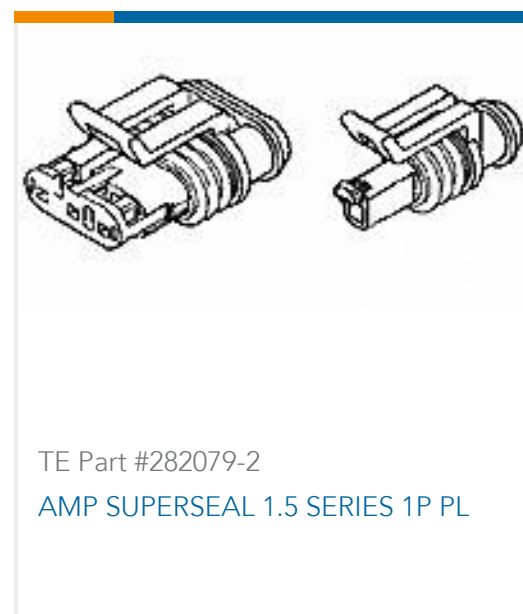
TE Part #282079-2 AMP SUPERSEAL 1.5 SERIES 1P PL