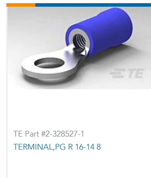
TE Part #2-328527-1 TERMINAL,PG R 16-14 8