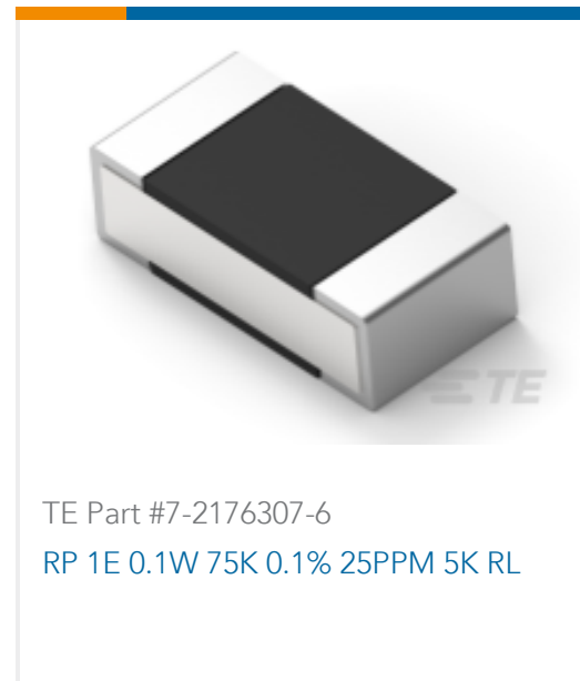
TE Part #7-2176307-6 RP 1E 0.1W 75K 0.1% 25PPM 5K RL