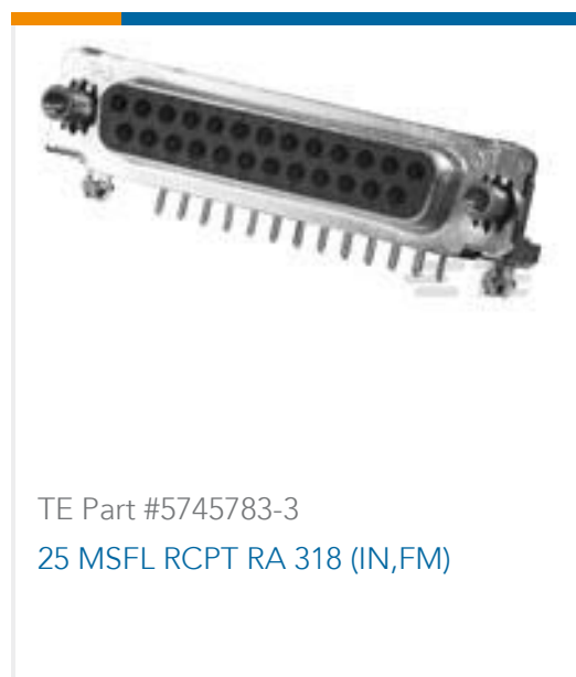
TE Part #5745783-3 25 MSFL RCPT RA 318 (IN,FM)