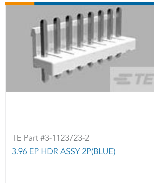
TE Part #3-1123723-2 3.96 EP HDR ASSY 2P(BLUE)