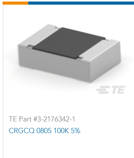
TE Part #3-2176342-1 CRGCQ 0805 100K 5%