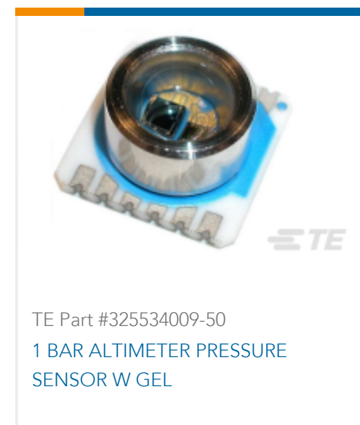
TE Part #325534009-50 1 BAR ALTIMETER PRESSURE SENSOR W GEL