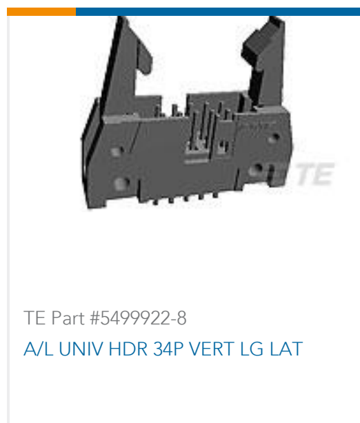
TE Part #5499922-8 A/L UNIV HDR 34P VERT LG LAT