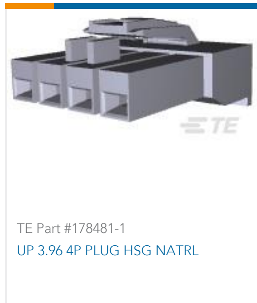
TE Part #178481-1 UP 3.96 4P PLUG HSG NATRL