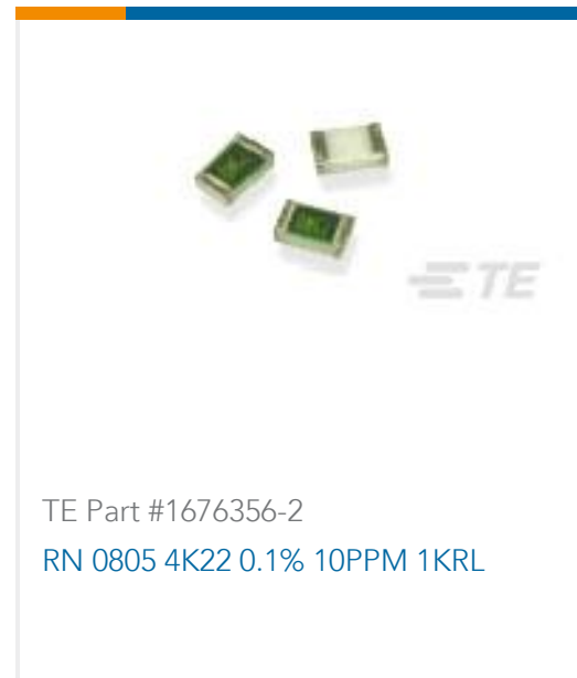
TE Part #1676356-2 RN 0805 4K22 0.1% 10PPM 1KRL