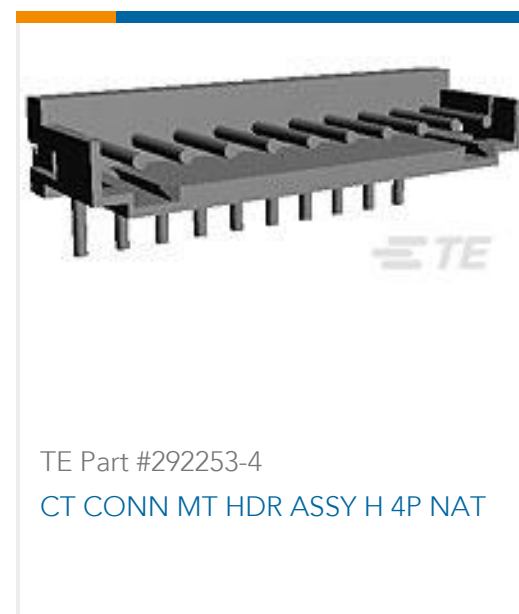
TE Part #292253-4 CT CONN MT HDR ASSY H 4P NAT