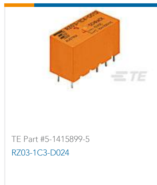
TE Part #5-1415899-5 RZ03-1C3-D024