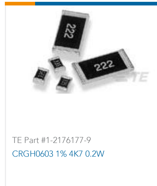
TE Part #1-2176177-9 CRGH0603 1% 4K7 0.2W