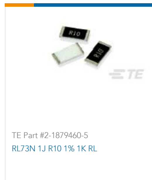
TE Part #2-1879460-5 RL73N 1J R10 1% 1K RL