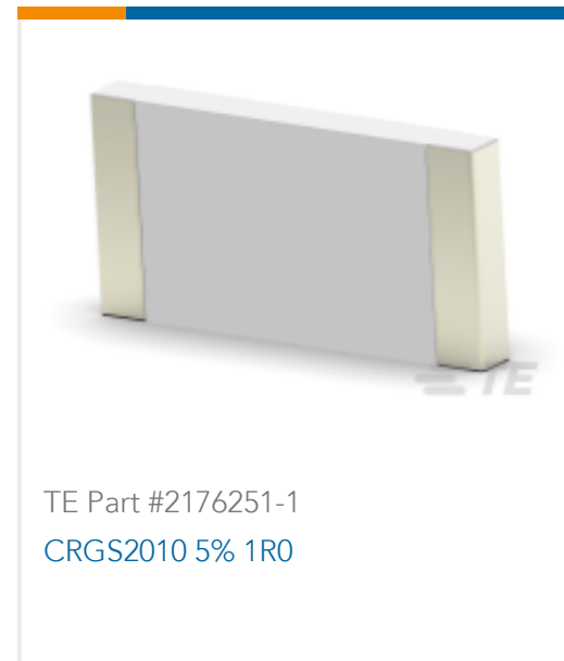
TE Part #2176251-1 CRGS2010 5% 1R0