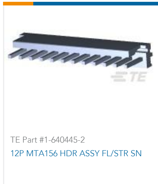
TE Part #1-640445-2 12P MTA156 HDR ASSY FL/STR SN