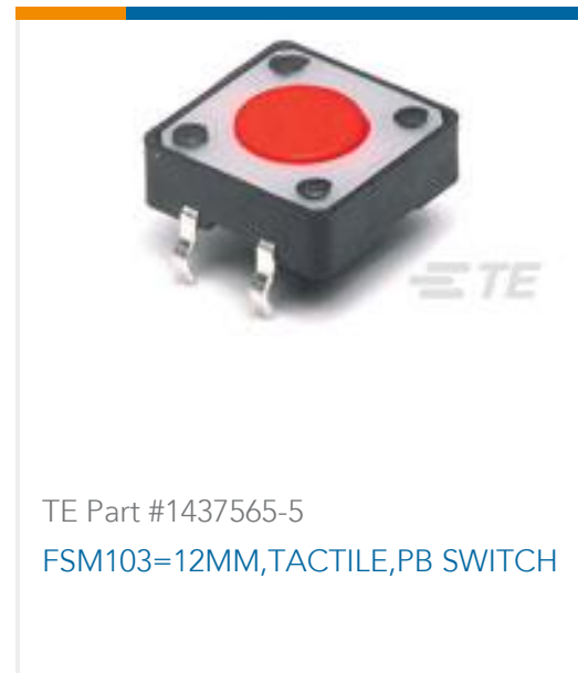
TE Part #1437565-5 FSM103=12MM,TACTILE,PB SWITCH