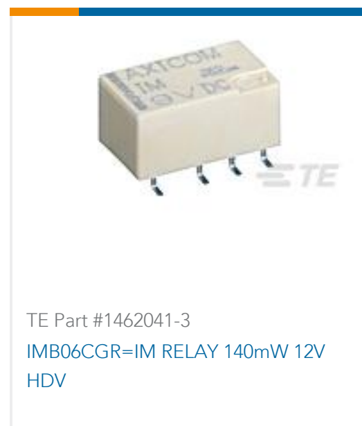
TE Part #1462041-3 IMB06CGR=IM RELAY 140mW 12V HDV