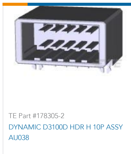
TE Part #178305-2 DYNAMIC D3100D HDR H 10P ASSY AU038