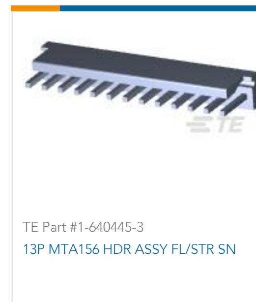
TE Part #1-640445-3 13P MTA156 HDR ASSY FL/STR SN