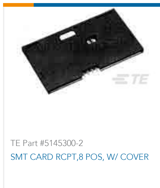
TE Part #5145300-2 SMT CARD RCPT,8 POS, W/ COVER