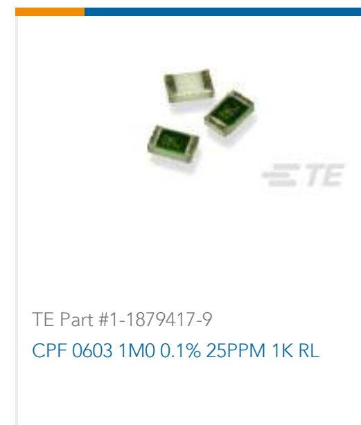
TE Part #1-1879417-9 CPF 0603 1M0 0.1% 25PPM 1K RL