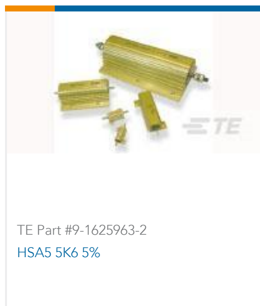
TE Part #9-1625963-2 HSA5 5K6 5%