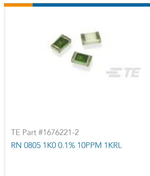
TE Part #1676221-2 RN 0805 1K0 0.1% 10PPM 1KRL