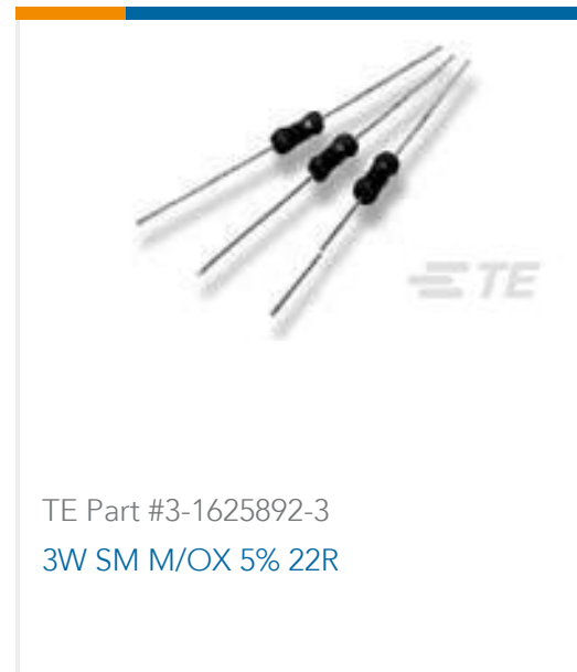
TE Part #3-1625892-3 3W SM M/OX 5% 22R