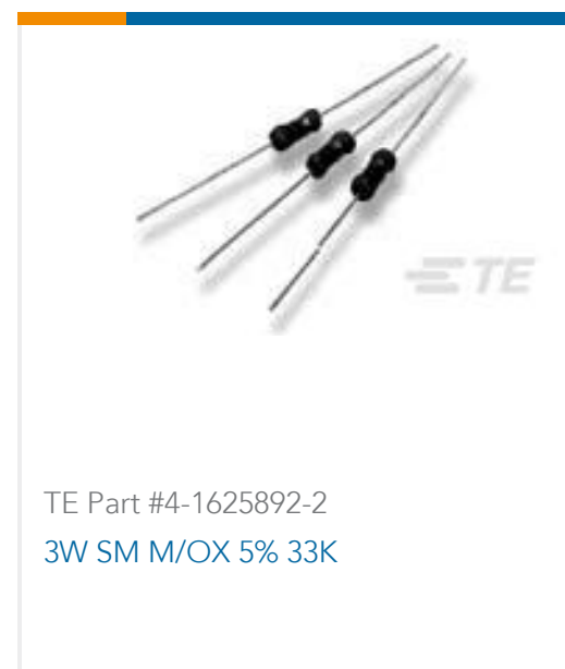
TE Part #4-1625892-2 3W SM M/OX 5% 33K