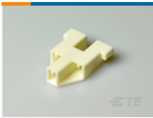
TE Part # 2825082-1 CLUSTER BLOCK HSG PBT