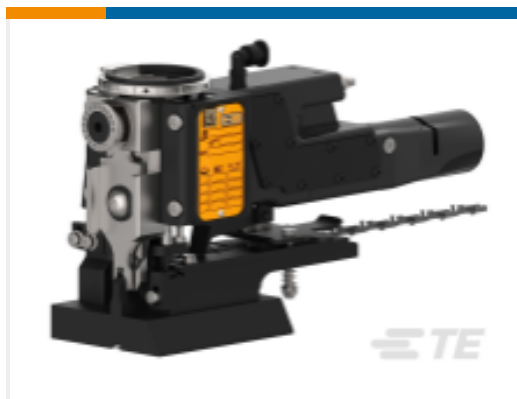
TE Part # 2-2150527-2 OCEAN_2.0_Applicator-E-090F150F