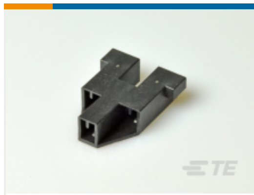
TE Part # 2825082-2 CLUSTER BLOCK HSG_V0-GWT