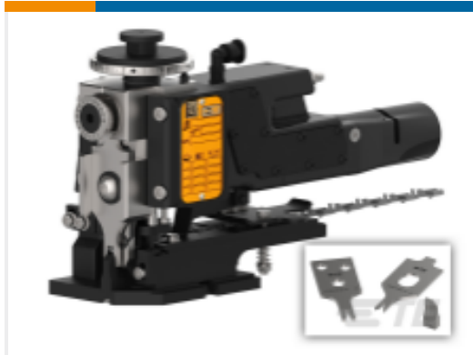
TE Part # 7-2150527-2 OCEAN_2.0_Applicator-E-090F150F