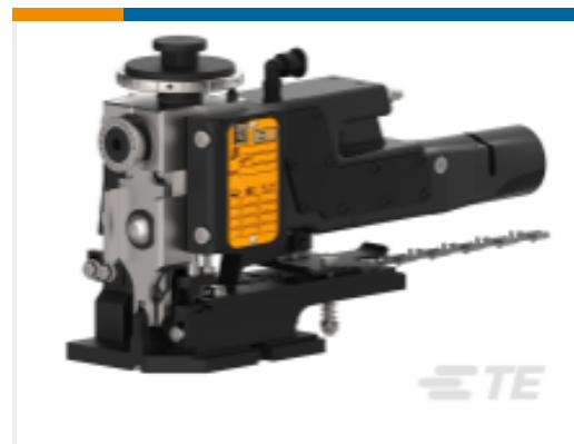
TE Part # 2150527-2 OCEAN_2.0_Applicator-E-090F150F