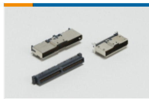
Internal I/O Connectors(135)