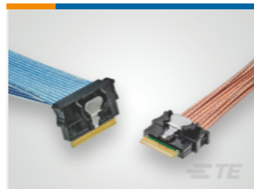
TE Part #2821385-1 SLIVER C/A, 74P, R/A TO R/A, 10GHZ, 85OHM