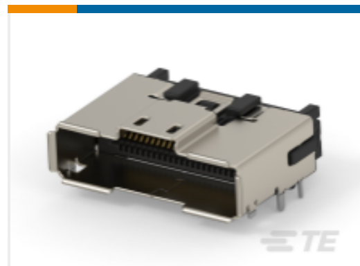
TE Part #2292055-1 RECEPTACLE ASSY RA 50 POSN MBC