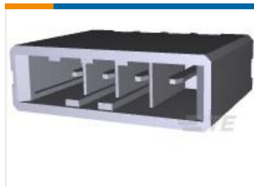
TE Part #1-917338-2 DYNAMIC 3200 VERTI. HDR ASY 4P