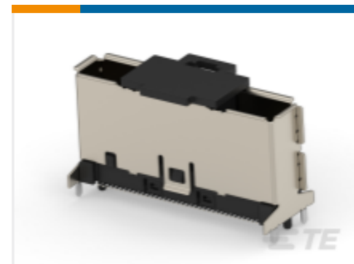
TE Part #2291316-1 RCPT CONN VERTICAL 74 POSN SLIVER