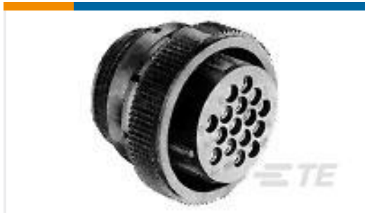
TE Part #182649-1 17-14 CPC PLUG RS