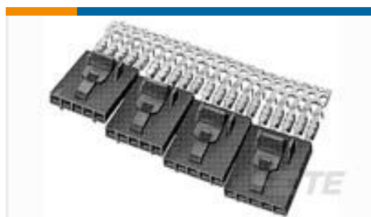
TE Part #5-103961-1 10X2 MTE RCPT SR LATCH .100CL