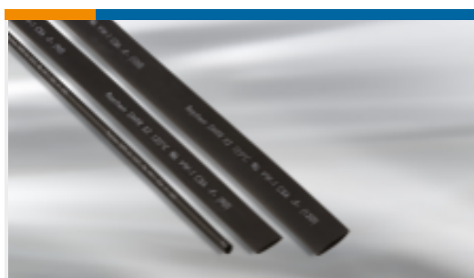
TE Part #EM7508-000 X4-9.0-0-FSP-SM