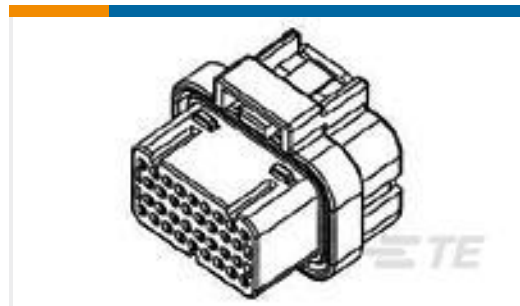
TE Part #4-1437290-0 34POS,SUPERSEAL,REC HSG ASSY, SLD,COD 1