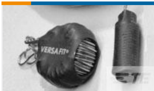
TE Part #D57591-000 VERSAFIT-MINI-SPL-3/8-BK