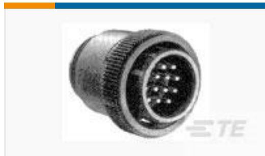
TE Part #206429-1 CPC PLUG ASSY, 11-4, REV SEX