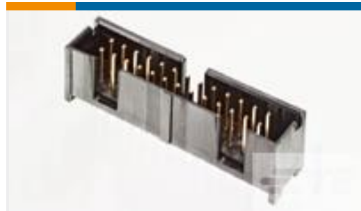
TE Part #5103309-3 A/L LOW PRO HDR 16P VERT BLACK