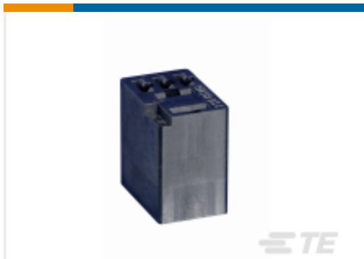
TE Part #1-1904045-6 V23333Z0001B046-EV-100