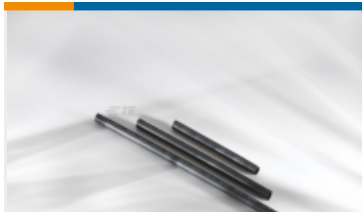
TE Part #CZ2554-000 SCT-NO.5-Z4-0-50MM