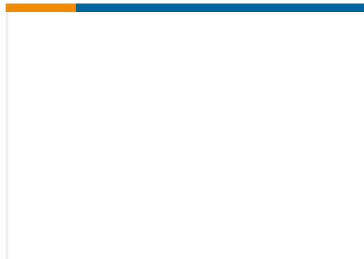
TE Part #20870-2 SWITCH,TOGGLE