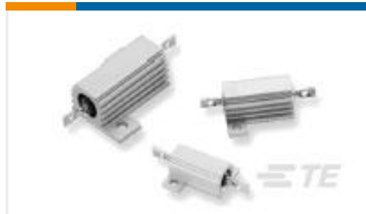
TE Part #5-1879075-3 THS25 5K6 5%