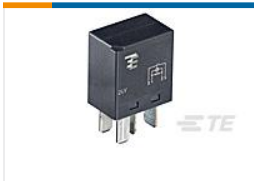
TE Part #6-1419137-4 V23074A2001A403-EV-CBOX