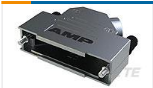
TE Part #1-1478763-5 METAL BACKSHELL 15 WAY 45 DE