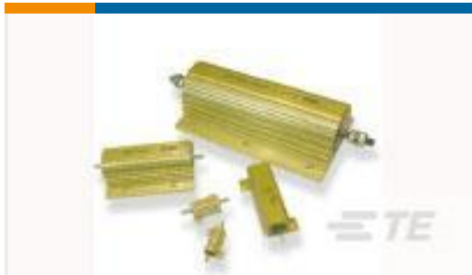
TE Part #1-1625999-5 HSC100 1R5 5%