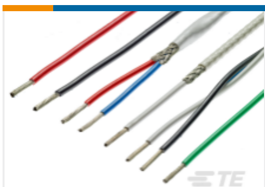
TE Part #CQ44703001 44A0111-22-OCK2000