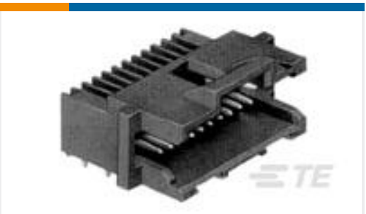
TE Part #6-104069-3 26 sys 50 hdr drra shrd sn