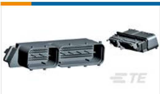
TE Part #284617-1 154pos hybrid MQS .63 header 90deg sld.