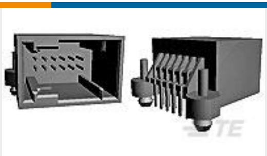
TE Part #185740-1 12pos MQS .63 header 90deg