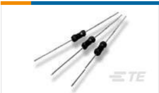
TE Part #1879350-1 RR01 5% R22 AMMO