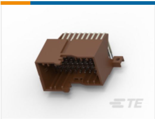
TE Part #9-966140-2 AMP MCP Unsealed Headers