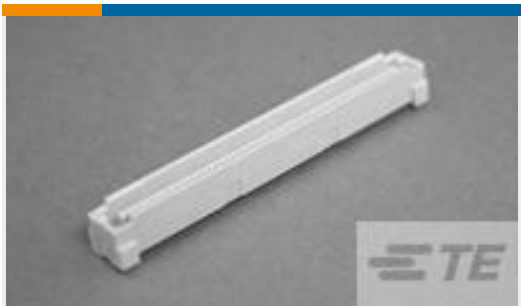
TE Part #5179029-3 0.8FH,P06H.5,080,08/Sn,TU