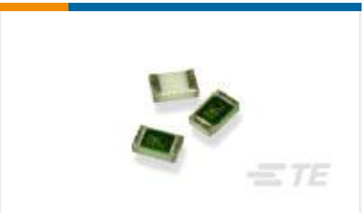
TE Part #7-1879208-3 CPF 0402 10K 0.1% 25PPM 1K RL