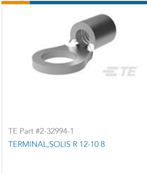
TE Part #2-32994-1 TERMINAL,SOLIS R 12-10 8