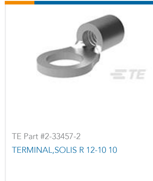
TE Part #2-33457-2 TERMINAL,SOLIS R 12-10 10