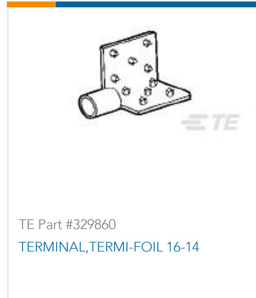
TE Part #329860 TERMINAL,TERMI-FOIL 16-14