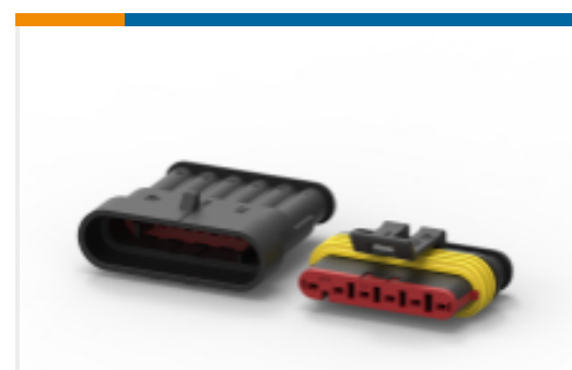
TE Part #282080-1 AMP SUPERSEAL 1.5MM, CONNECTOR HOUSING