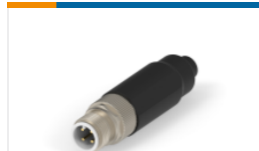
TE Part #1-2823445-1 M12 D-M-4, CRIMP, CAT5 RADOX 6.6 MM, H&S