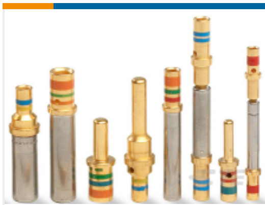
TE Part # 2560-212-2231 CONT PIN