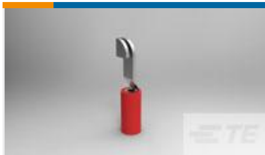
TE Part #320555 KNIFE DISCONNECT,N PIDG 22-16