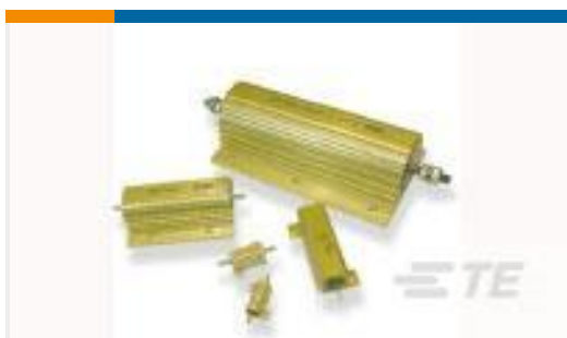
TE Part #9-1625971-2 HSA25 8K2 5%