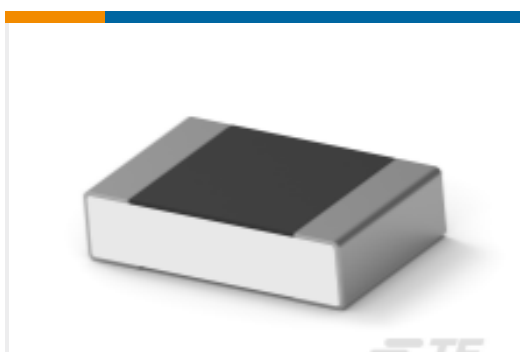
TE Part #5-2176379-6 RQ 0805 402R 0.1% 10PPM 5K RL