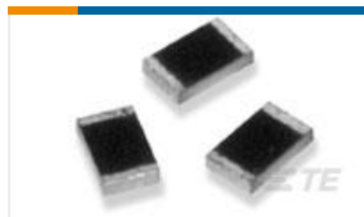
TE Part #1-1625868-1 RP 2A 0.25W 301R 0.1% 25PPM 1K RL