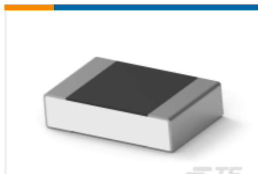
TE Part #3-2176379-5 RQ 0805 243R 0.1% 10PPM 5K RL