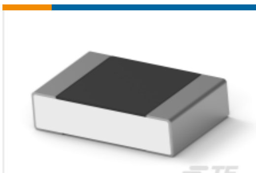
TE Part #2176381-9 RQ 0805 15K 0.1% 10PPM 5K RL