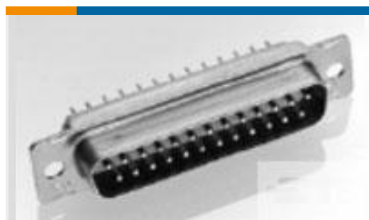
TE Part #1-1757819-0 AMPLIMITE,ASY,PLUG,STD,109,ZN,5,CT