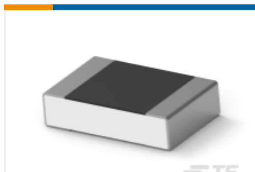
TE Part #9-2176379-8 RQ 0805 1K1 0.1% 10PPM 5K RL