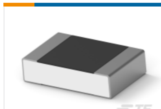
TE Part #4-2176381-1 RQ 0805 32K4 0.1% 10PPM 5K RL