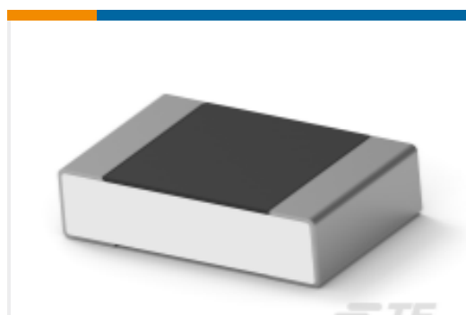
TE Part #9-2176376-9 RQ 0805 130K 0.1% 10PPM 1K RL