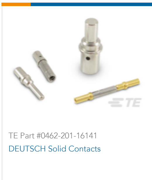
TE Part #0462-201-16141 DEUTSCH Solid Contacts