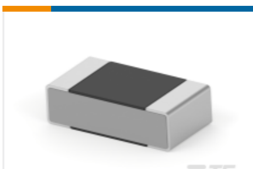
TE Part #5-1879207-7 RN 0603 383K 0.1% 10PPM 5K RL