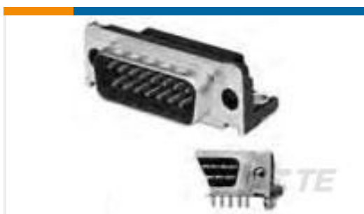
TE Part #747843-4 37 MSFL PLUG RA 318 (IN,FM,BL)