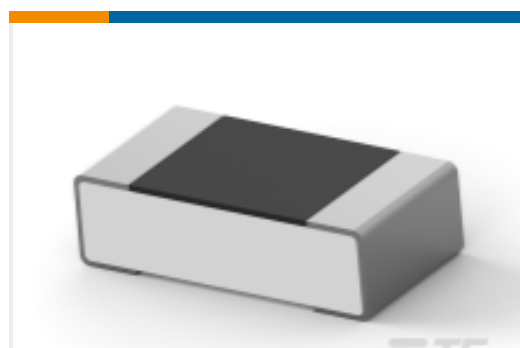
TE Part #2176372-2 RQ 0603 51K1 0.1% 10PPM 5K RL