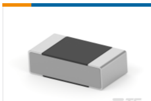
TE Part #6-1879207-1 RN 0603 422K 0.1% 10PPM 5K RL