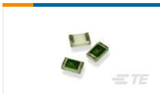
TE Part #4-1879208-9 CPF 0402 1K0 0.1% 25PPM 1K RL