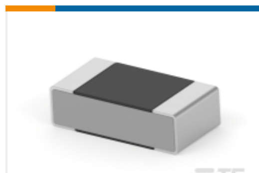
TE Part #2-1879207-0 RN 0603 316K 0.1% 10PPM 5K RL