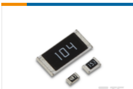
TE Part #5-2176343-9 CRGCO 1206 680K 1%