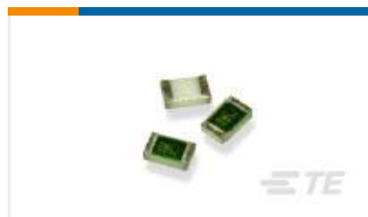
TE Part #1879339-3 CPF 0603 301K 1% 50PPM 1K RL