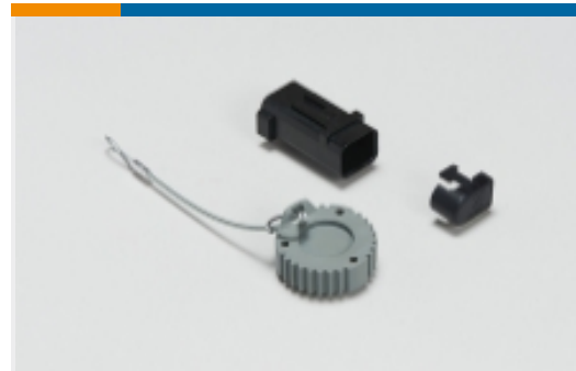
Automotive Connector Caps & Covers (32)