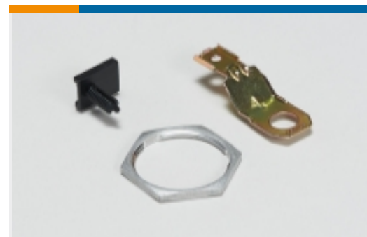
Other Automotive Connector Accessories(11)