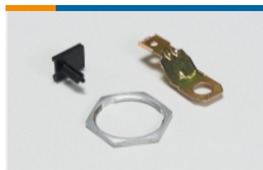
Other Automotive Connector Accessories(5)