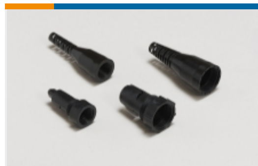
Connector Strain Relief(5)