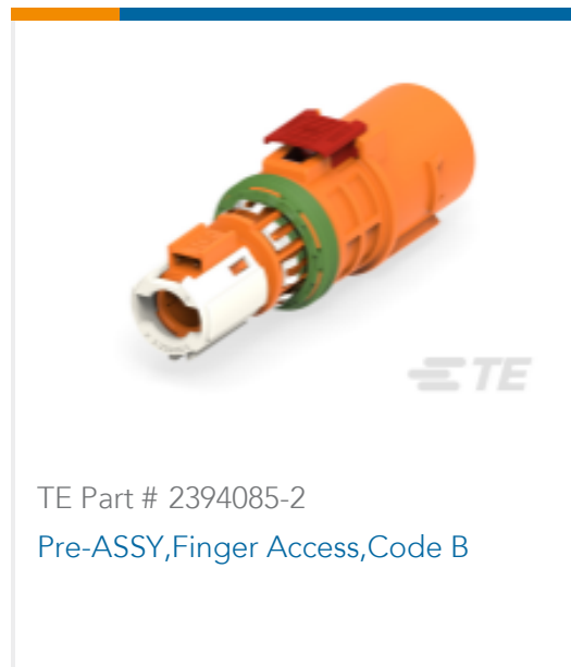
TE Part # 2394085-2 Pre-ASSY, Finger Access, Code B