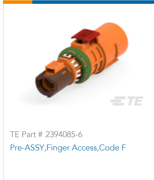
TE Part # 2394085-6 Pre-ASSY, Finger Access, Code F