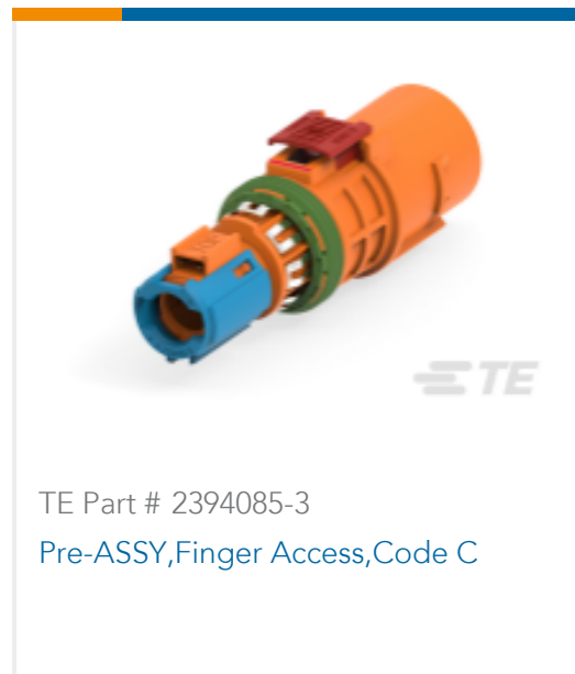
TE Part # 2394085-3 Pre-ASSY, Finger Access, Code C