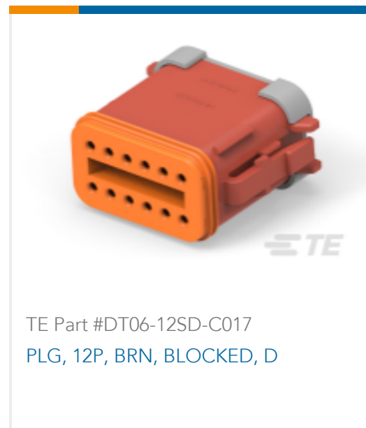
TE Part # DT06-12SD-C017 PLG, 12P, BRN, BLOCKED, D