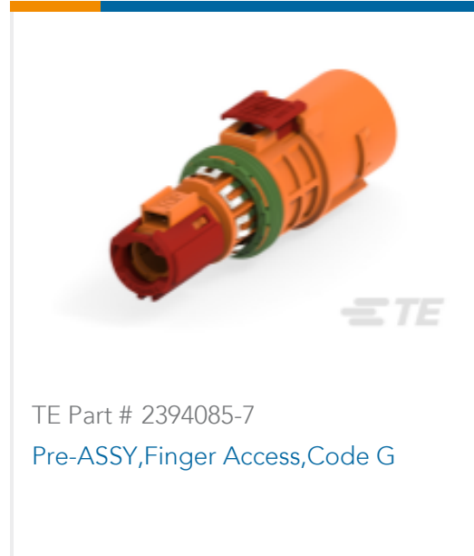
TE Part # 2394085-7 Pre-ASSY, Finger Access, Code G