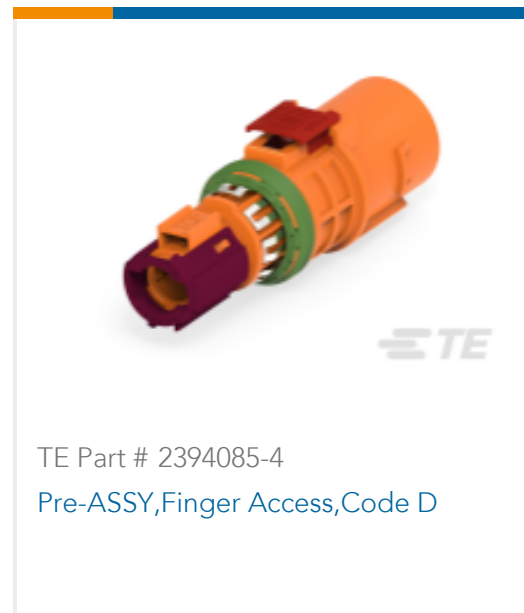
TE Part # 2394085-4 Pre-ASSY, Finger Access, Code D