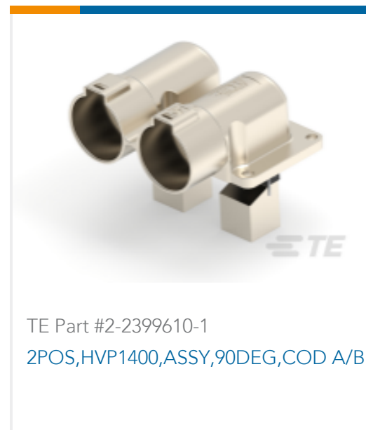
TE Part # 2-2399610-1 2POS, HVP1400, ASSY, 90DEG, COD A/B