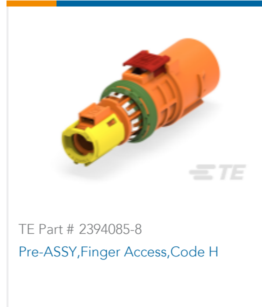
TE Part # 2394085-8 Pre-ASSY, Finger Access, Code H