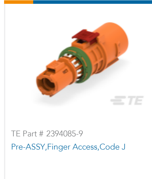
TE Part # 2394085-9 Pre-ASSY, Finger Access, Code J