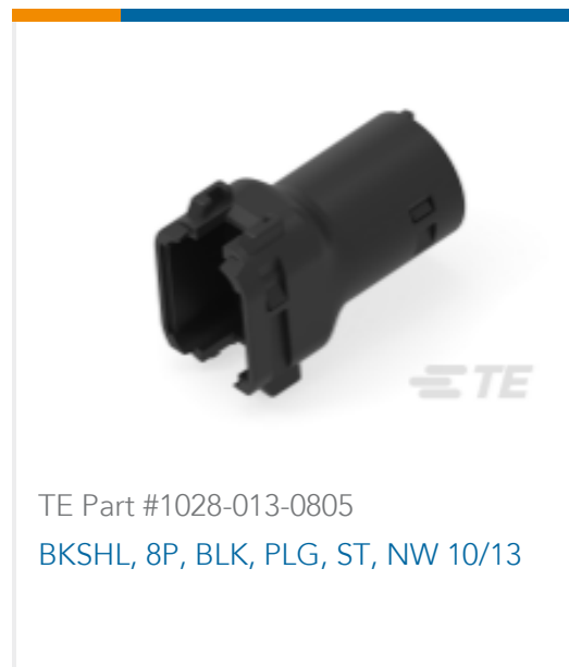
TE Part # 1028-013-0805 BKSHL, 8P, BLK, PLG, ST, NW 10/13