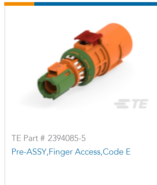
TE Part # 2394085-5 Pre-ASSY, Finger Access, Code E