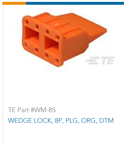
TE Part # WM-85 WEDGE LOCK, 8P, PLG, ORG, DTM