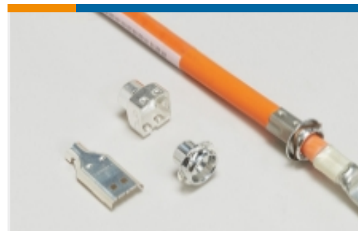
Automotive Connector EMC Shielding (6)