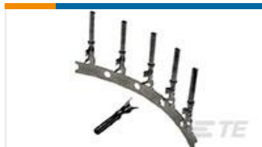
TE Part # 1062-20-0122 SOC, SF, SIZE 20, 16-22, NI/NI