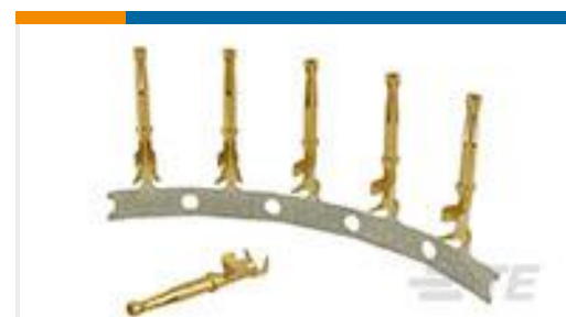
TE Part # 1062-20-0344 SOC, SF, SIZE 20, 16-22, SLEVLSS, AU /SN