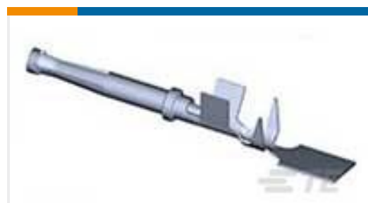
TE Part # 1062-20-0322 SOC, SF, SIZE 20, 16-22, SLEVLSS, NI /NI