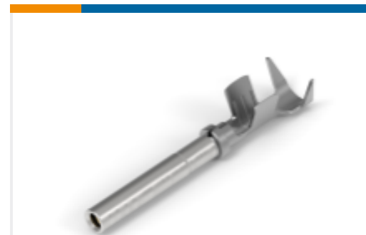
TE Part # 1062-20-0144 SOC, SF, SIZE 20, 16-22, AU/SN