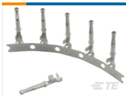
TE Part # 1062-20-0377 SOC, SF, SIZE 20, 16-22, SLEVLSS, SN /SN