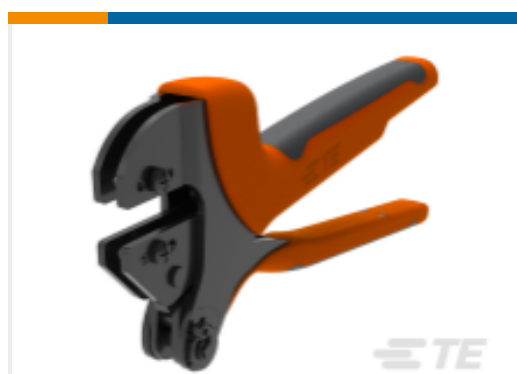
TE Part # 2362810-1 SDE CRIMP HAND TOOL FRAME W /O DIES