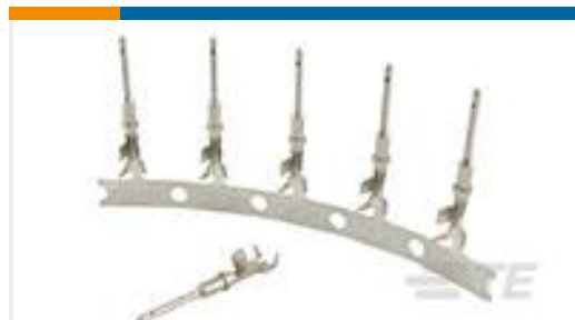
TE Part # 1060-20-0122 PIN, SF, SIZE 20, 16-22, NI/NI