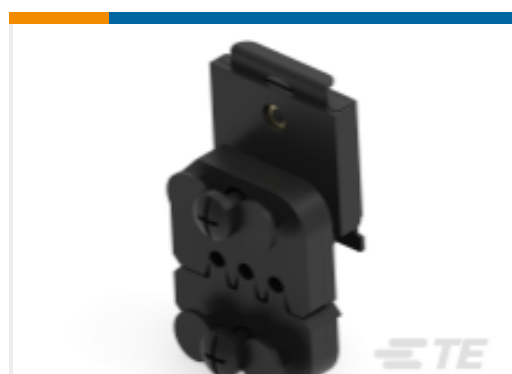
TE Part # 2391435-2 SDE F PIN/SOCKET 16-18 DIE SET