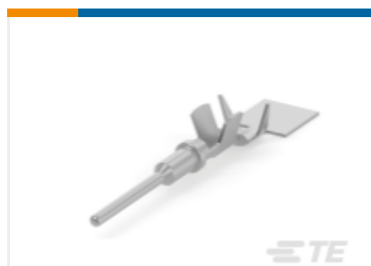
TE Part # 1060-20-0177 PIN, SF, SIZE 20, 16-22, SN/SN