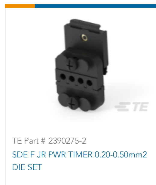
TE Part # 2390275-2 SDE F JR PWR TIMER 0.20-0.50mm2 DIE SET