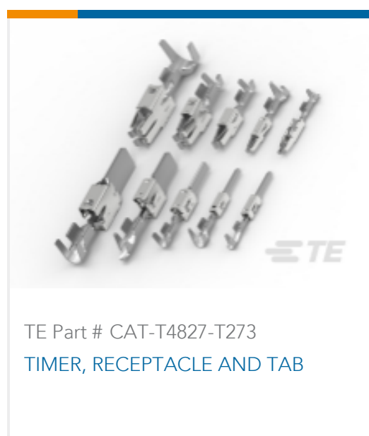
TE Part # CAT-T4827-T273 TIMER, RECEPTACLE AND TAB