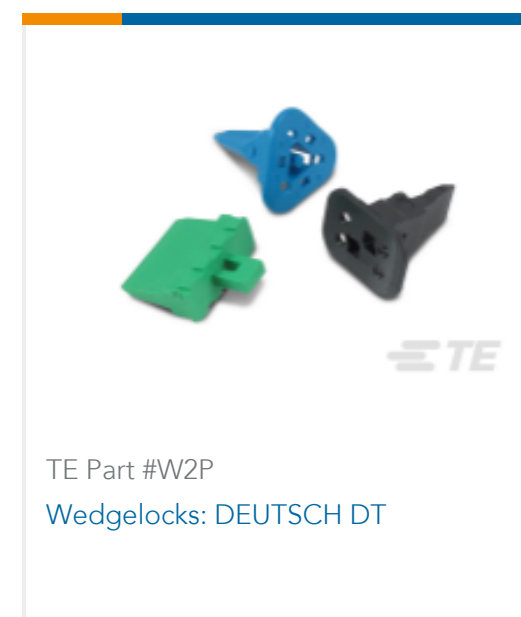
TE Part #W2P Wedgelocks: DEUTSCH DT