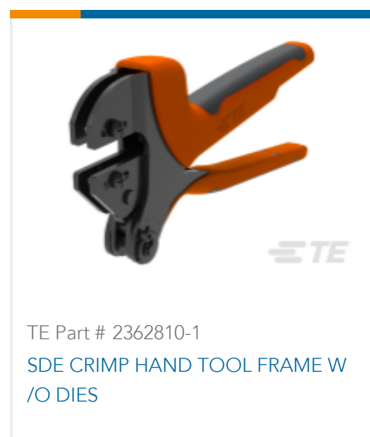
TE Part # 2362810-1 SDE CRIMP HAND TOOL FRAME W /O DIES