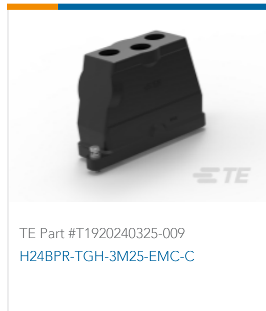
TE Part #T1920240325-009 H24BPR-TGH-3M25-EMC-C