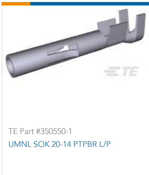
TE Part #350550-1 UMNL SOK 20-14 PTPBR L/P