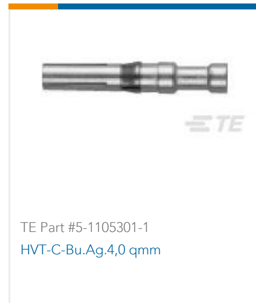
TE Part #5-1105301-1 HVT-C-Bu.Ag.4,0 qmm