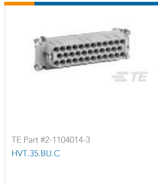
TE Part #2-1104014-3 HVT.35.BU.C