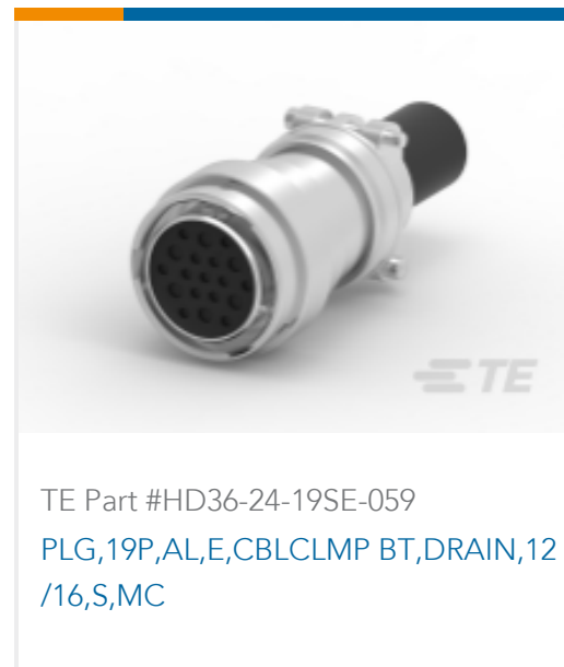
TE Part #HD36-24-19SE-059 PLG,19P,AL,E,CBLCLMP BT,DRAIN,12 /16,S,MC