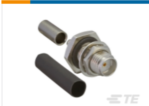
TE Part #CONSMA014 SMA Jack 50 Ohm Cable Crimp Panel Mount