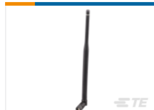
TE Part #ANT-868-OC-LG-SMA Antenna Straight Whip 868MHz Swivel SMA