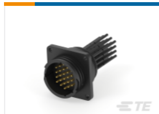
TE Part #2387127-1 FL RPT CONN CA,STD,SER 1,23-24, L 0.5M