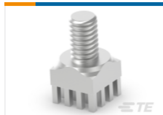
TE Part #225677-E POWELM STIFT VOLLM M5 8 2,54 * EP 4,5 *