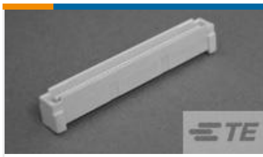
TE Part #5179031-2 0.8FH,P08H.5,060,08/Sn,TU