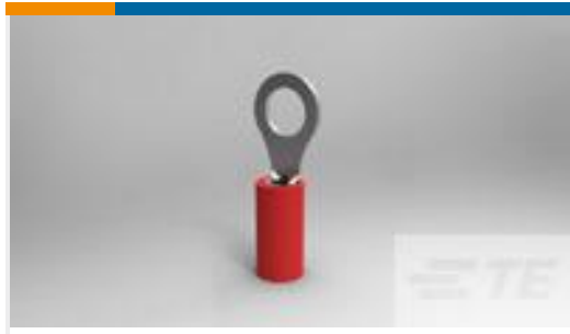
TE Part #36154 PIDG R 22-16 COMM 22-18 MIL 10