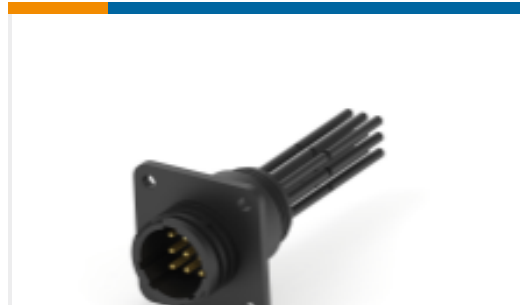
TE Part #2387118-1 FL RPT CONN CA,STD,SER 1,SZ 13-9, LG 0.5M