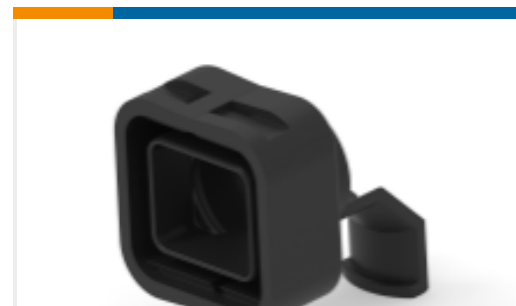
TE Part #ZPF000000000203390 787-8055-00