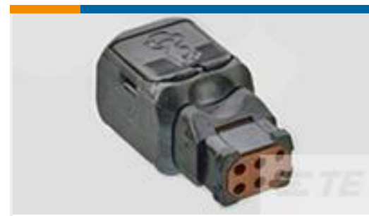
TE Part #D369-R66-NP0 369 6 WAY REC, NO CONTACTS, PIN