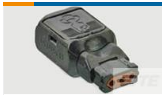
TE Part #D369-R33-NP0 369 3 WAY REC, NO CONTACTS, PIN