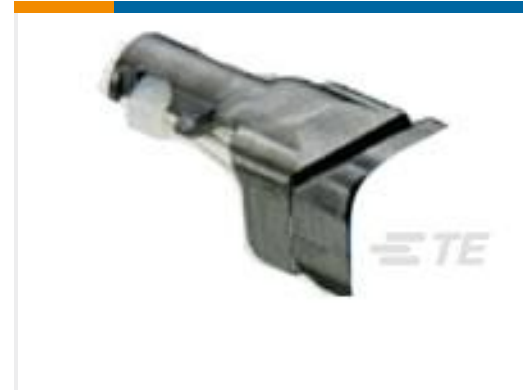
TE Part #D369-STB-3 369 3 WAY BACKSHELL STRAIGHT TIE WRAP