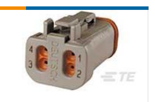
TE Part #DT06-4S-EP04 PLG, 4P, GRY, N, CAP