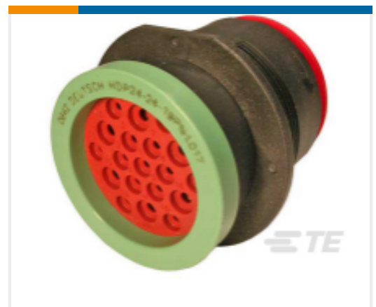
TE Part #HDP24-24-19PN-L017 REC, 19P, BLK, N, RNG, 12/16, P