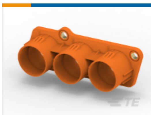
TE Part # 2355146-2 3POS,IPT,RING TONGUE HSG ASSY, SLD