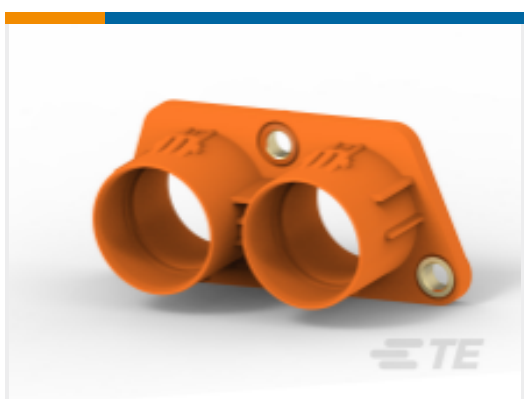
TE Part # 2371017-2 2POS,IPT,RING TONGUE HSG ASSY, SLD