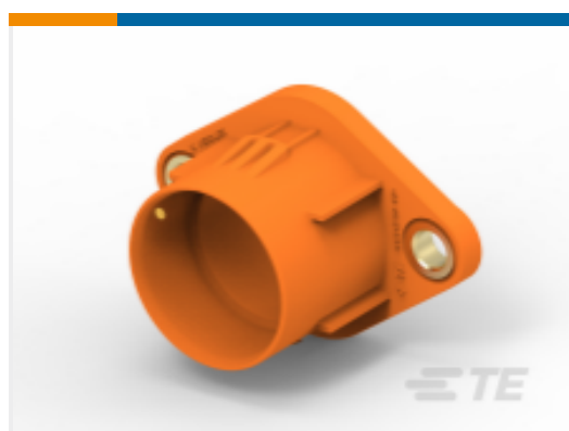
TE Part # 2371019-2 1POS,IPT,RING TONGUE HSG ASSY, SLD