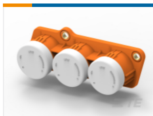
TE Part # 2355146-1 3POS,IPT,RING TONGUE HSG ASSY, SLD