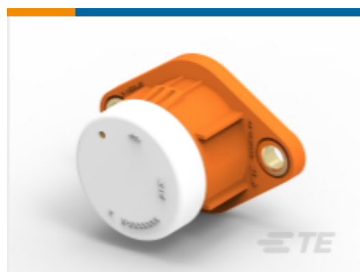
TE Part # 2371019-1 1POS,IPT,RING TONGUE HSG ASSY, SLD