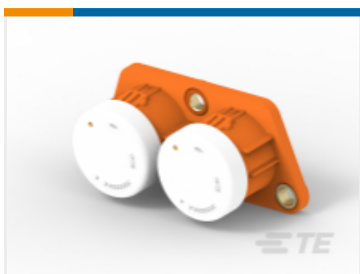
TE Part # 2371017-1 2POS,IPT,RING TONGUE HSG ASSY, SLD