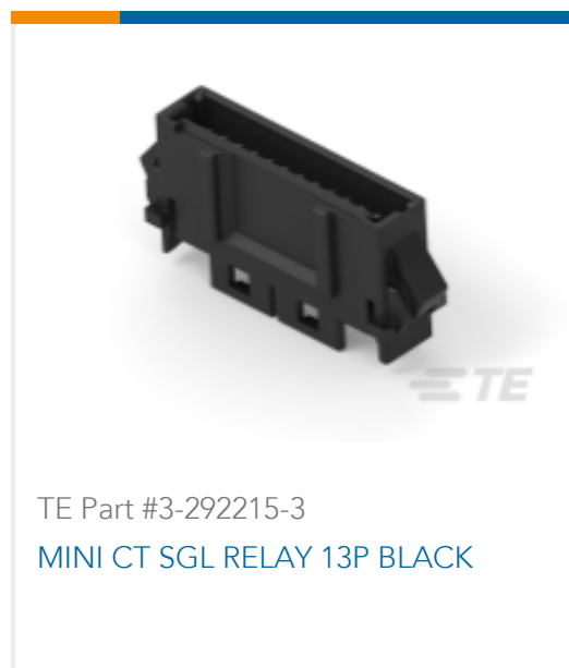
TE Part #3-292215-3 MINI CT SGL RELAY 13P BLACK