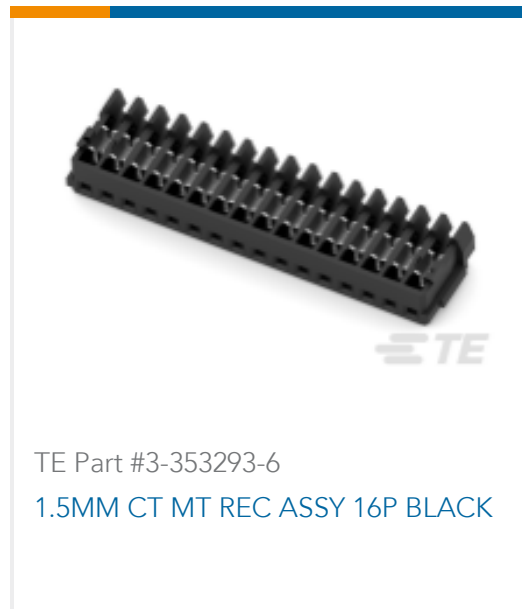
TE Part #3-353293-6 1.5MM CT MT REC ASSY 16P BLACK