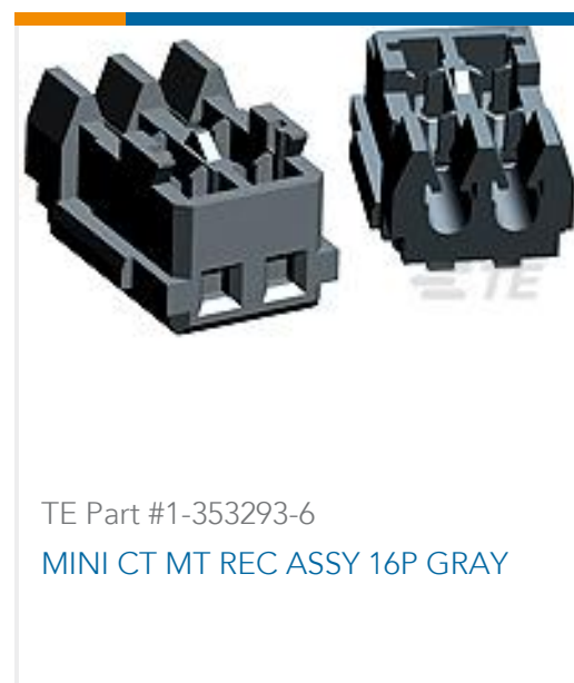
TE Part #1-353293-6 MINI CT MT REC ASSY 16P GRAY