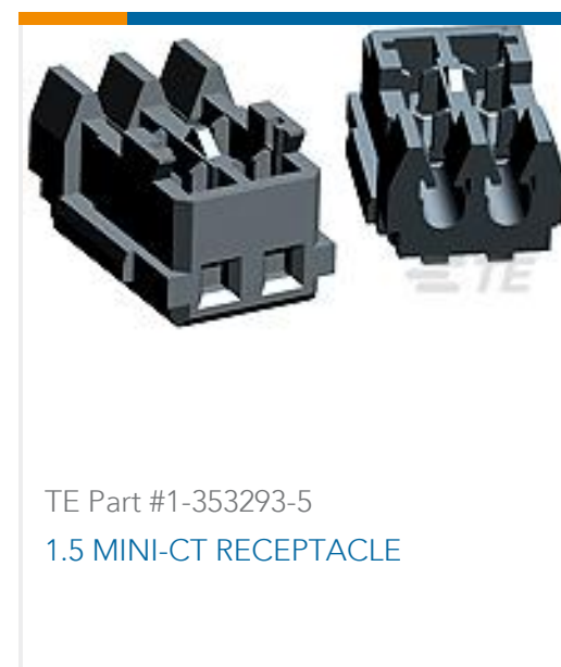
TE Part #1-353293-5 1.5 MINI-CT RECEPTACLE