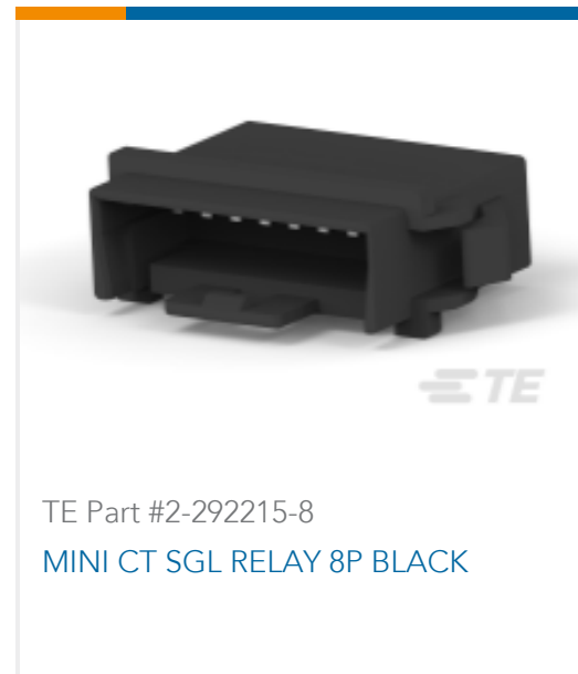
TE Part #2-292215-8 MINI CT SGL RELAY 8P BLACK