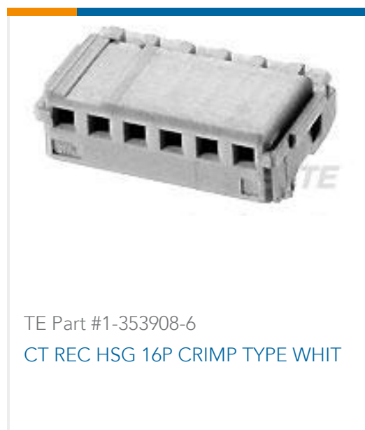
TE Part #1-353908-6 CT REC HSG 16P CRIMP TYPE WHIT