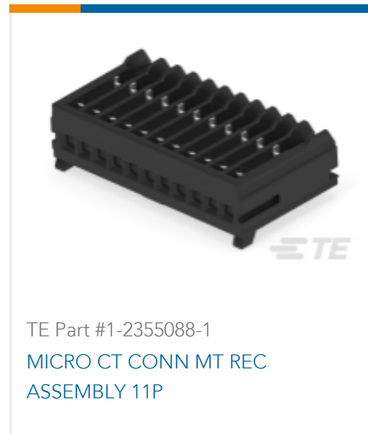
TE Part #1-2355088-1 MICRO CT CONN MT REC ASSEMBLY 11P