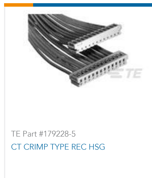
TE Part #179228-5 CT CRIMP TYPE REC HSG