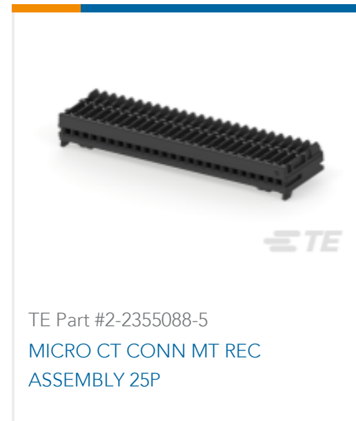
TE Part #2-2355088-5 MICRO CT CONN MT REC ASSEMBLY 25P