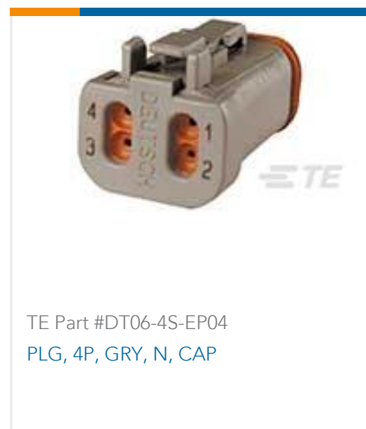
TE Part #DT06-4S-EP04 PLG, 4P, GRY, N, CAP