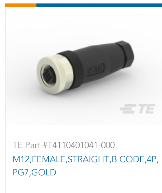
TE Part #T4110401041-000 M12,FEMALE,STRAIGHT,B CODE,4P, PG7,GOLD