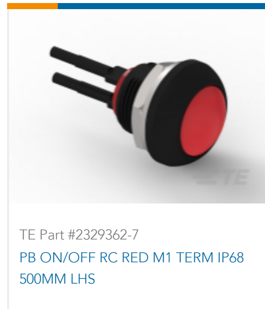
TE Part #2329362-7 PB ON/OFF RC RED M1 TERM IP68 500MM LHS