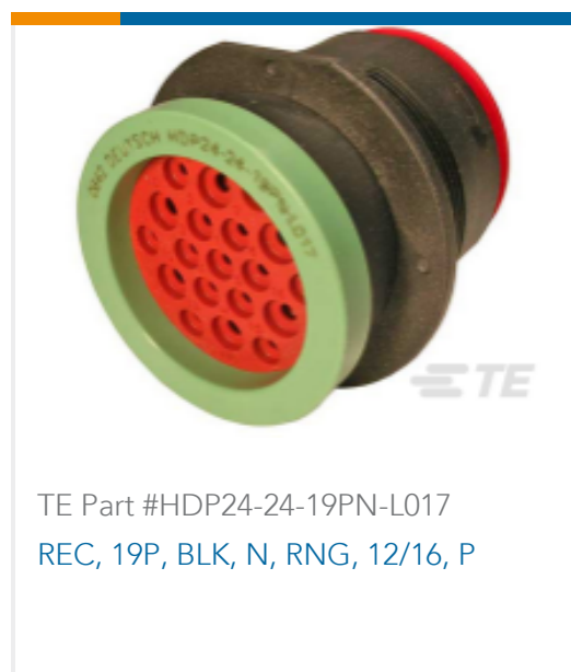
TE Part #HDP24-24-19PN-L017 REC, 19P, BLK, N, RNG, 12/16, P