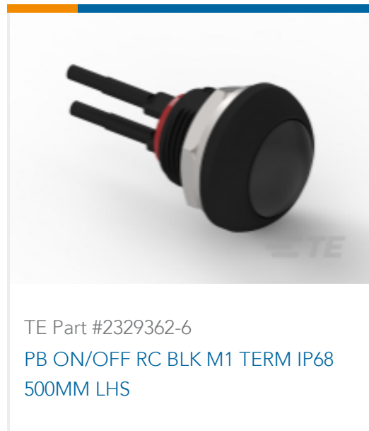
TE Part #2329362-6 PB ON/OFF RC BLK M1 TERM IP68 500MM LHS