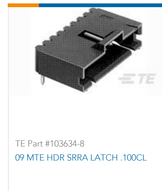
TE Part #103634-8 09 MTE HDR SRRA LATCH .100CL