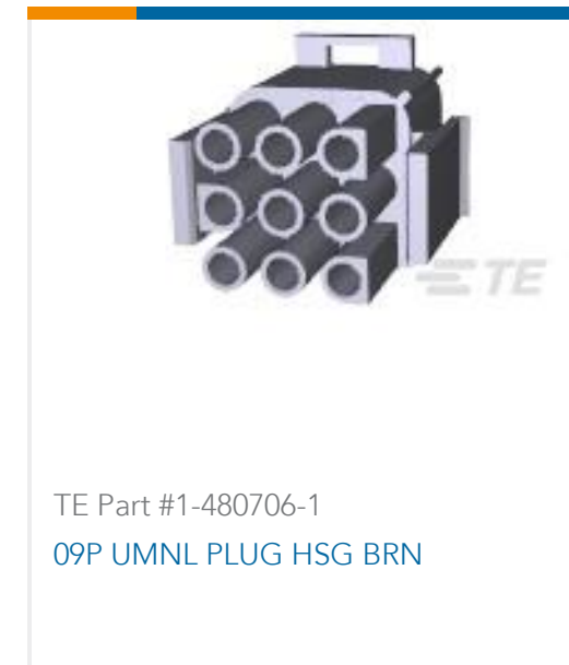
TE Part #1-480706-1 09P UMNL PLUG HSG BRN