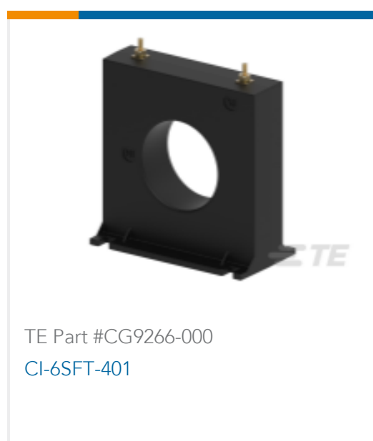
TE Part #CG9266-000 CI-6SFT-401