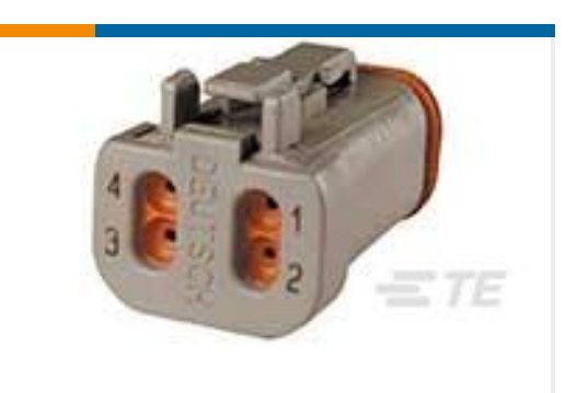
TE Part #DT06-4S-EP04 PLG, 4P, GRY, N, CAP