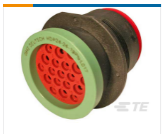
TE Part #HDP24-24-19PN-L017 REC, 19P, BLK, N, RNG, 12/16, P