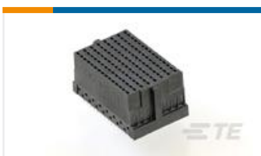
TE Part #1934949-1 Tinman 5pr 8col vert rcpt 15mm stack