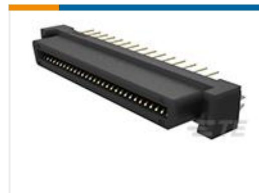
TE Part #1734101-3 Champ050 series,30pos,Au over PdNi