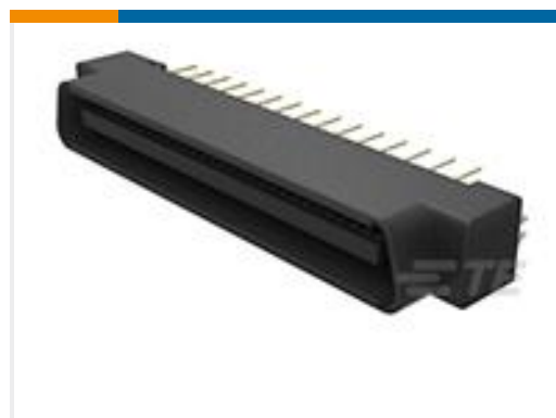
TE Part #1734100-3 Champ050 series,30pos,Au over PdNi