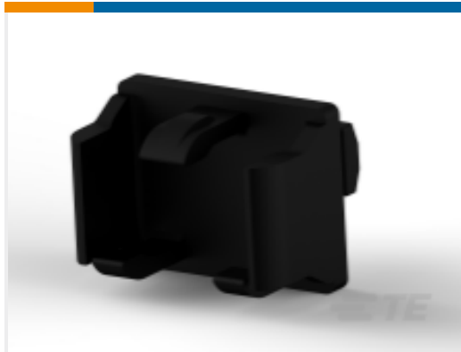
TE Part # 1761394-1 DUST COVER, SFP, GANGED & STACKED