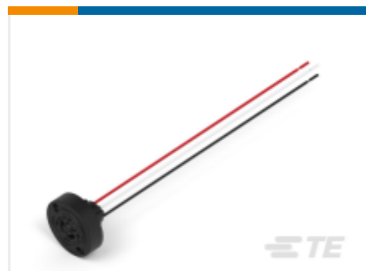
TE Part #6-2213362-2 RCPT ASSY,DIMMABLE PHOTOCNTROL,150C,3 P