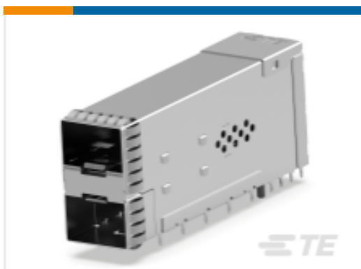
TE Part #2349202-5 SFP56 STACKED 2X1 RECEPTACLE ASSEMBLY