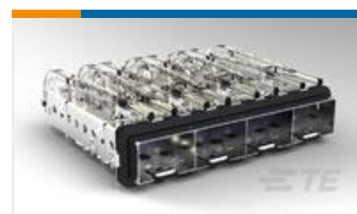
TE Part #2110570-1 SFP+ 1x4 Cage Assembly Square Light Pipe