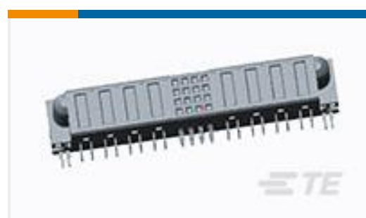
TE Part #2-6450880-4 MBXLE R/A RCPT 4P16S4P