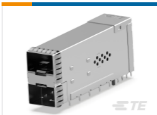
TE Part #2349202-5 SFP56 STACKED 2X1 RECEPTACLE ASSEMBLY