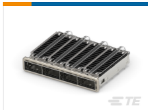
TE Part #1-2170287-1 1X4 CAGE ASSEMBLY, QSFP,SINGLE SQ LP