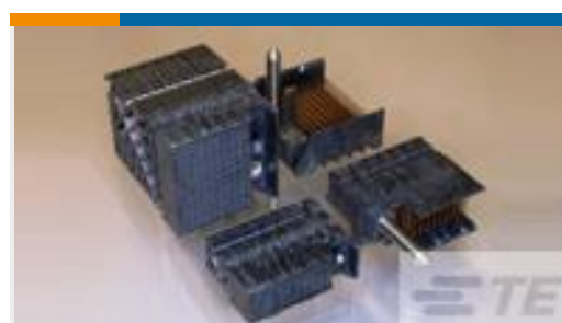
TE Part #2007808-2 IMP100S,H,V4P10C,LG,OEW46,4.9