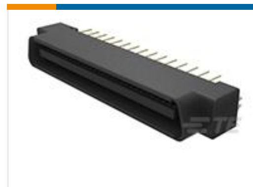
TE Part #1734100-3 Champ050 series,30pos,Au over PdNi