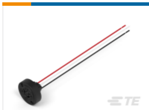
TE Part #6-2213362-2 RCPT ASSY,DIMMABLE PHOTOCONTROL,150C,3 P