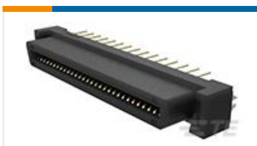
TE Part #1734101-3 Champ050 series,30pos,Au over PdNi