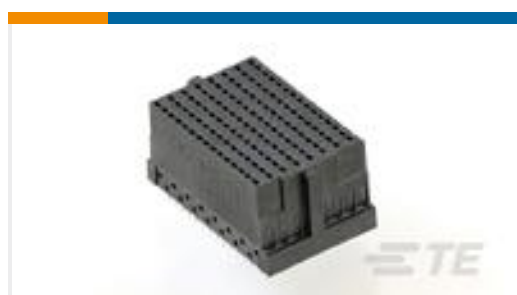
TE Part #1934949-1 Tinman 5pr 8col vert rcpt 15mm stack