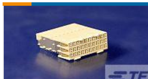
TE Part #6469081-1 HMZD 3PR, RECEPTACLE ASSEMBLY