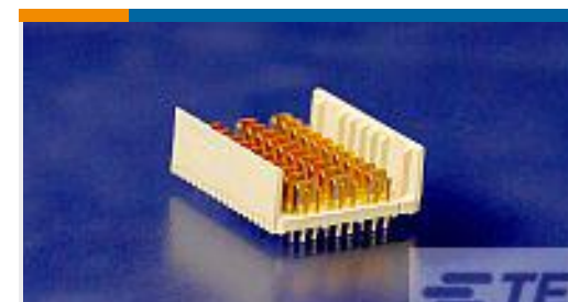
TE Part #6469083-1 HMZD 3PAIR, HDR ASSY, 25MM MOD