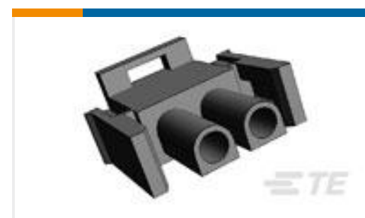
TE Part #1-480698-0 02P UMNL PLUG HSG NATL