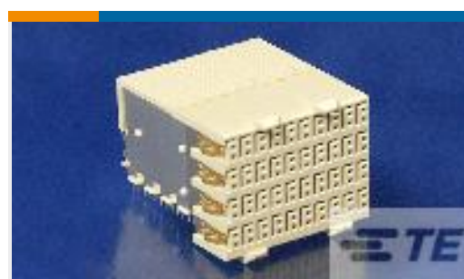
TE Part #2065657-1 zd Plus, 4 pair, receptacle assy