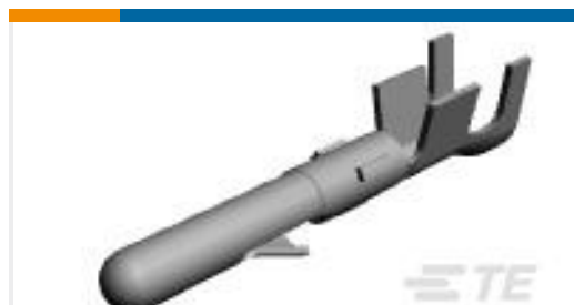
TE Part #60618-4 CMNL PIN PTPPHBZL/P