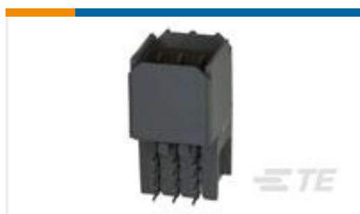
TE Part #5223961-1 TE UPM R/A Header 3P STD Power, LLL