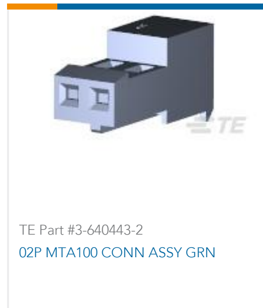
TE Part #3-640443-2 02P MTA100 CONN ASSY GRN