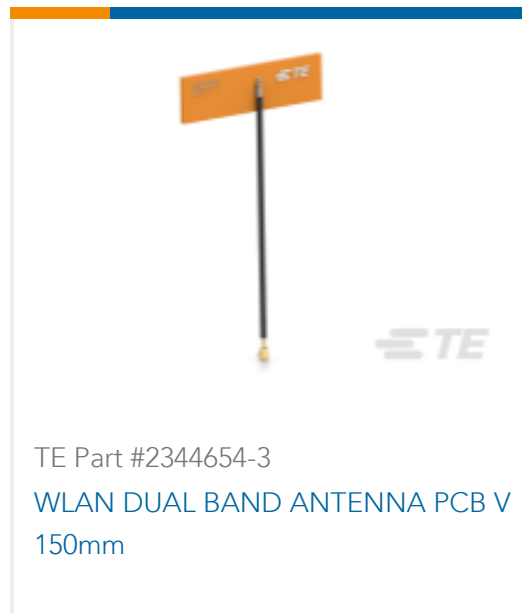
TE Part #2344654-3 WLAN DUAL BAND ANTENNA PCB V 150mm