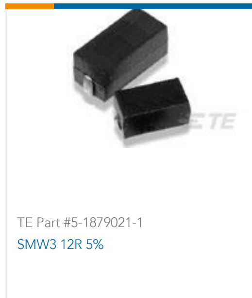
TE Part #5-1879021-1 SMW3 12R 5%