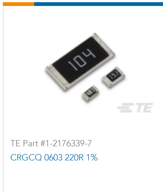
TE Part #1-2176339-7 CRGCO 0603 220R 1%