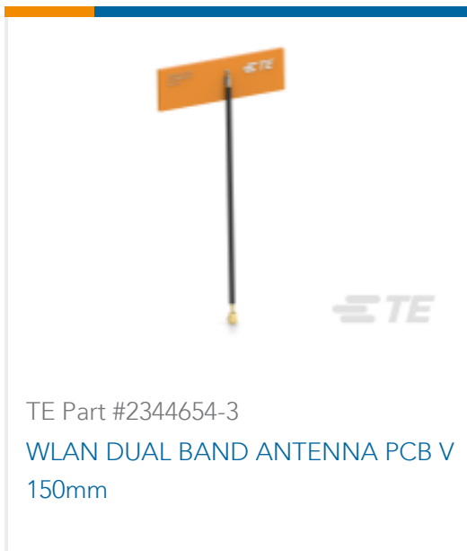
TE Part #2344654-3 WLAN DUAL BAND ANTENNA PCB V 150mm