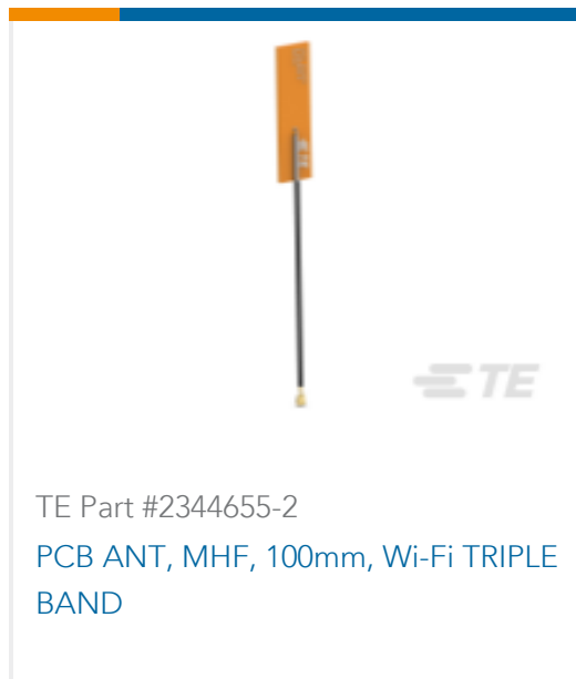
TE Part #2344655-2 PCB ANT, MHF, 100mm, Wi-Fi TRIPLE BAND