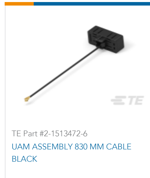
TE Part #2-1513472-6 UAM ASSEMBLY 830 MM CABLE BLACK