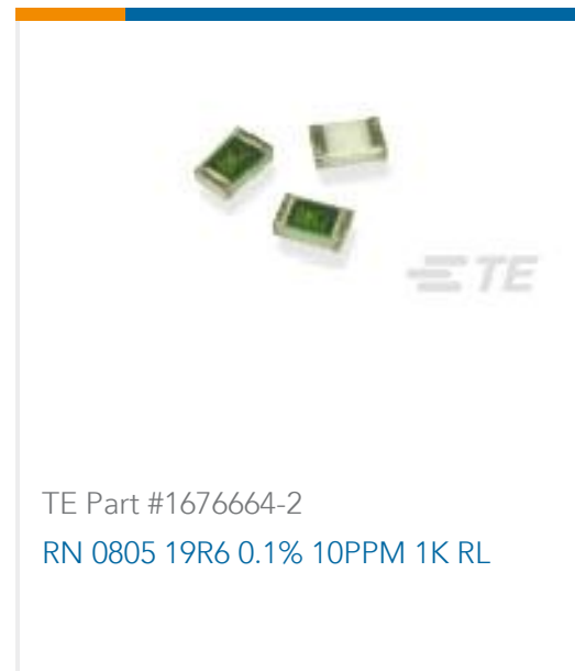
TE Part #1676664-2 RN 0805 19R6 0.1% 10PPM 1K RL