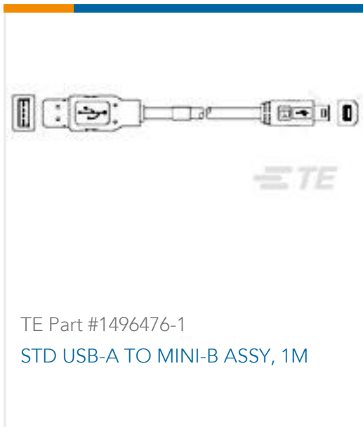
TE Part #1496476-1 STD USB-A TO MINI-B ASSY, 1M