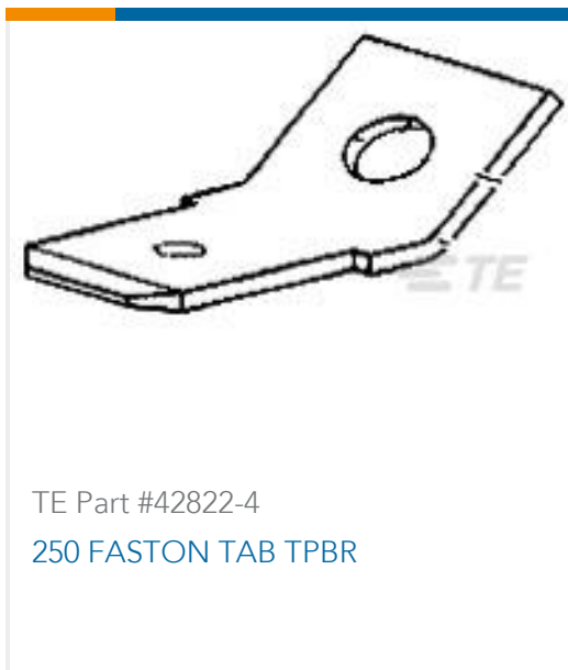
TE Part #42822-4 250 FASTON TAB TPBR