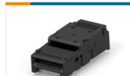
TE Part #2325864-2 SFP-DD RECEPTACLE W HOLD DOWNS ASSEMBLY