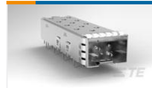
TE Part #2007194-1 SFP+ 1x1 Cage Assembly, PCI, Solder Tail