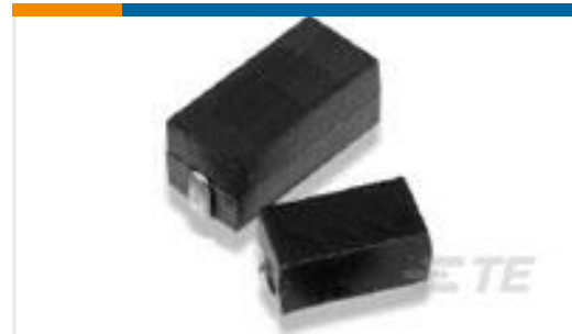
TE Part #2-1879022-9 SMF3 4K7 5%