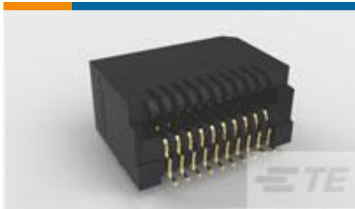
TE Part #1367073-1 20 POS SMT CONN, SFP, 15AU