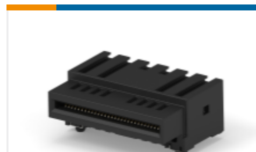
TE Part #2344064-4 CONNECTOR ASSEMBLY, SMT, OSFP 112