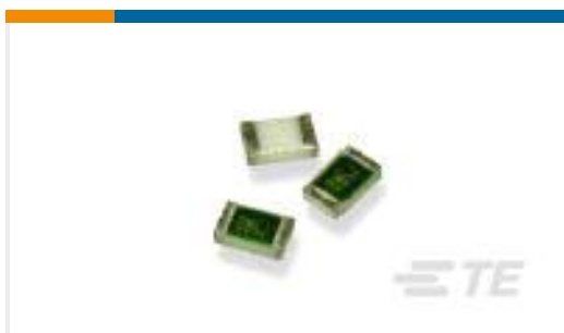
TE Part #2-1879338-7 CPF 0603 49K9 1% 50PPM 1K RL