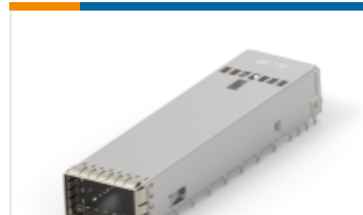
TE Part #2317416-1 OSFP 1X1 CAGE ASSMBLY