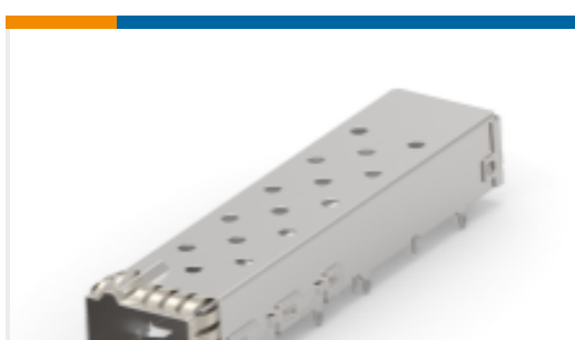
TE Part #2335809-1 CAGE ASSEMBLY WIHT SPRING,SFP- DD 1X1