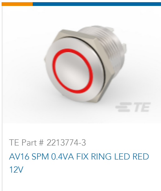
TE Part # 2213774-3 AV16 SPM 0.4VA FIX RING LED RED 12V