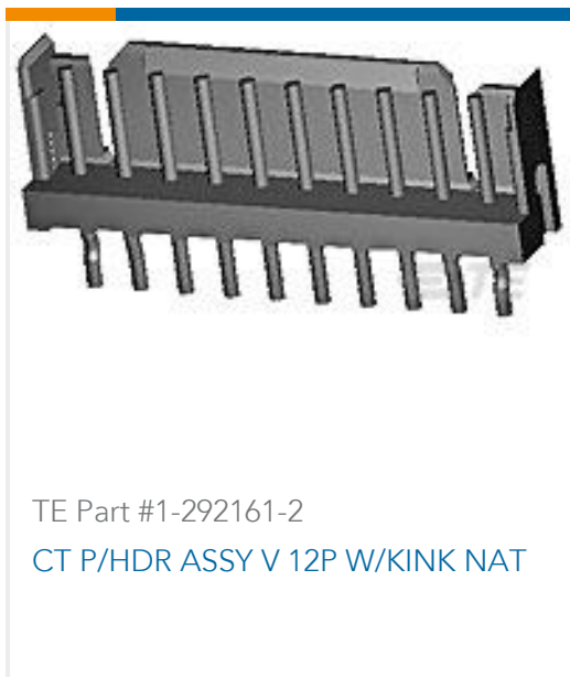
TE Part #1-292161-2 CT P/HDR ASSY V 12P W/KINK NAT