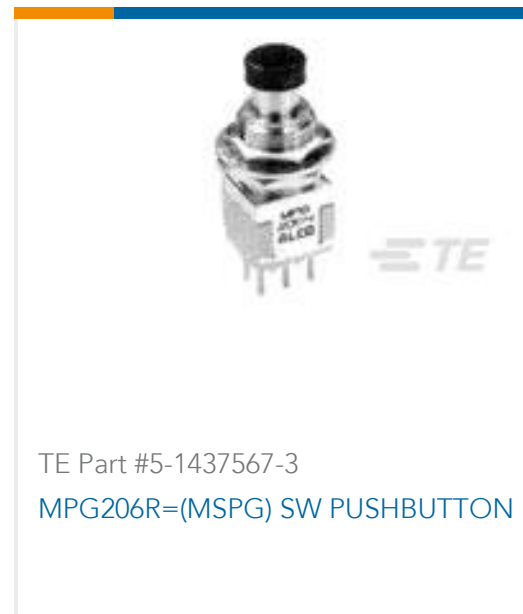
TE Part #5-1437567-3 MPG206R=(MSPG) SW PUSHBUTTON