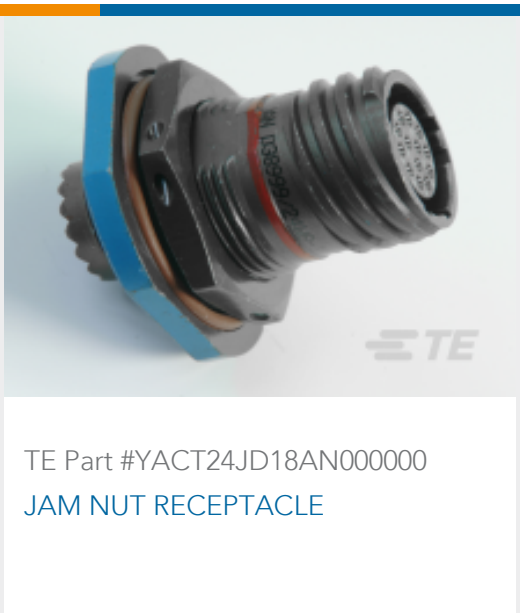
TE Part #YACT24JD18AN000000 JAM NUT RECEPTACLE