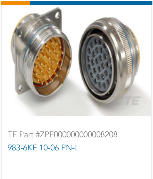
TE Part #ZPF000000000008208 983-6KE 10-06 PN-L