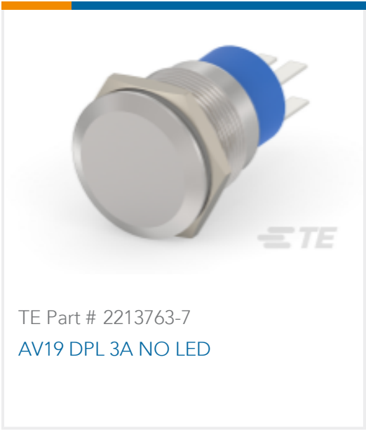
TE Part # 2213763-7 AV19 DPL 3A NO LED