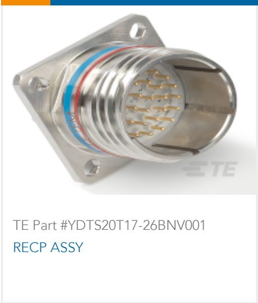
TE Part #YDTS20T17-26BNV001 RECP ASSY