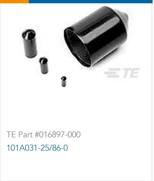
TE Part #016897-000 101A031-25/86-0