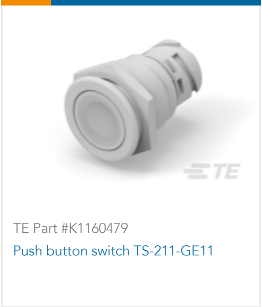
TE Part #K1160479 Push button switch TS-211-GE11