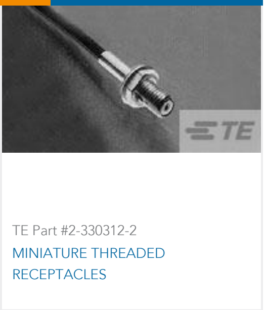
TE Part #2-330312-2 MINIATURE THREADED RECEPTACLES